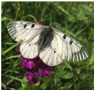
Clouded Apollo (IN)

Hirudo medicinalis medicinal leech Cepaea nemoralis banded snail Helix aspersa garden snail Arion ater a large black slug Gryllus campestris field cricket Libellula depressa broad-bodied chaser Libellula quadrimaculata four-spotted chaser Anechura bipunctata an earwig Nepa cinerea water scorpion Libelloides coccajus an ascalaphid Graphosoma italicum Italian shield bug Pyrhocoris apterus fire-bug Cicindela campestris green tiger-beetle Coccinella 7-punctata 7-spot ladybird Phylloperla horticola garden chafer Vespa crabro hornet Bombus pascuorum common carder-bee Eucera sp. a long-horned bee Formica rufa wood ant Tipula maxima a crane-fly Gerris sp. (probably pond skater)