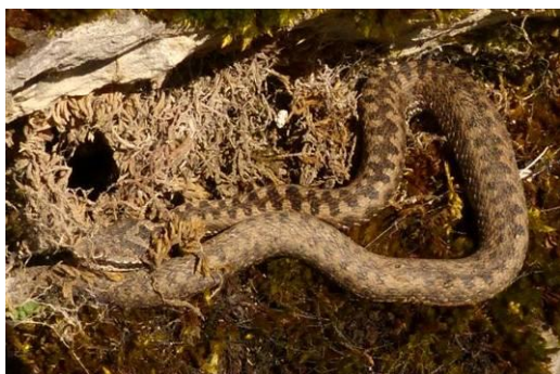
Asp viper (C&OD)

Common frog Pyrenean brook newt Common wall lizard Southern smooth snake Asp viper