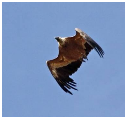
Griffon vulture diving (JC)

There are two rivers that come together in Gèdre. The Héas is crossed by a bridge just a few yards from the hotel and was home to a dipper this morning, while in the trees above serins trilled their welcome. Walking on to the second bridge over the Gavarnie – the Gave de Gavarnie ou Pau on maps – an adult lammergeier drifted overhead again, followed by a buzzard, but a flurry of aerial activity on the skyline also caught our eye as a kestrel mobbed a golden eagle which eventually perched on the ridge and allowed a distant but clear telescope view. This second bridge is known by Honeyguide as 'dipper bridge' and, sure enough, after a few moments waiting one bird flew beneath the bridge and landed downstream.