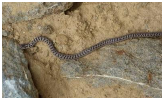
Young southern smooth snake (CD)