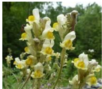
Frog orchid, yellow pea and Pyrenean toadflax (CD) all at Bué