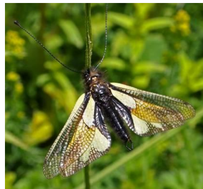
Libelloides coccajus (JC)