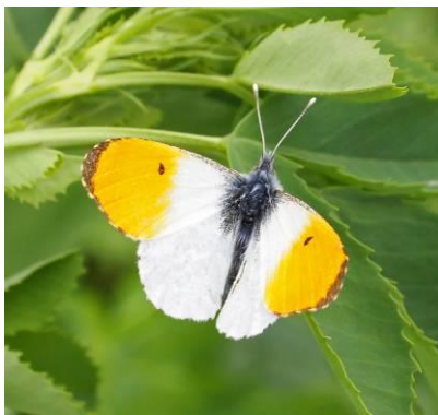
Orange tip (JC)