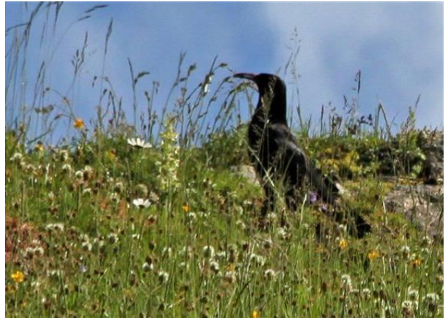
Edelweiss (CD) and chough (JC)

The weather was still kind for this walk, clean and bright (like the edelweiss) and not too hot so we continued up toward the hotel/café that overlooks the cirque. As the path rose, the view changed again as we weaved among rocks and trees. This last climb is always a little taxing and best done when the café is open as the reward of a great view is much enhanced with a chair and a glass of shandy. From the terrace we looked across the last part of the route and up toward la grande cascade , the highest waterfall in France. For the eight of us in this group, this was our stopping point but other brave souls continued to the base of the pretty waterfall. We watched and had lunch before making our way back down the path.