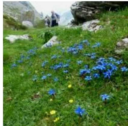
Spring gentians (CD)

Farther round and young southern smooth snakes gave brief views to a few of the leading group members while a Camberwell beauty was more obliging for everyone. We took in the perfumed pink flowers of garland flower and unscented alpenroses. Onwards and the narrow path on the edge of the lake led us alongside fragrant and marsh orchids, saxifrages and stands of tall asphodels before opening into more alpine pasture alongside the river. Greater butterwort and birdseye primroses gave shelter to young frogs in the damper patches, alpine choughs broke the skyline and mazarine and small blue butterflies took nutrients from the soil by the river.