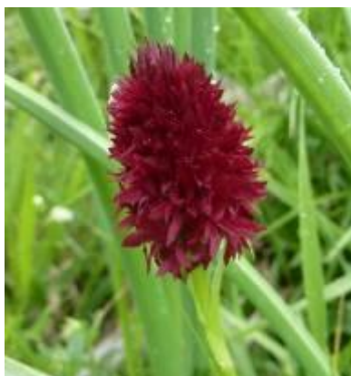
Top: Black vanilla orchid (CD) Left: Burnt-tip orchid (JC)

We took a drive further down the spectacular Ossoue valley as yet again the weather closed in. Narcissus pseudonarcissus bicolor daffodils caught Celia's eye and alongside these, found when she clambered up to take a photograph, were tiny rush-leaved narcissi. A search revealed a few black vanilla orchids poking out of the grass in damper areas, while alongside the river broad-leaved marsh orchids numbered in the hundreds.