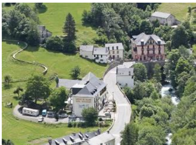
Looking down on the Hotel La Brèche de Roland, Le Grotte (pink) and the Héas River (JC)

As we gathered outside the hotel, Chris spotted an Oberthur's skipper on a downpipe. As we watched it sunning itself in the heat of a sunny Pyrenean morning, Oliver looked to the sky and to our surprise found a young lammergeier drifting overhead. This all-dark bird was then joined by a paler adult. Not a bad start and we hadn't even got off the hotel drive yet. A few yards away one of the meadows runs alongside the road, giving a great introduction to some of the common flora – yellow rattle, bladder campion and small scabious.