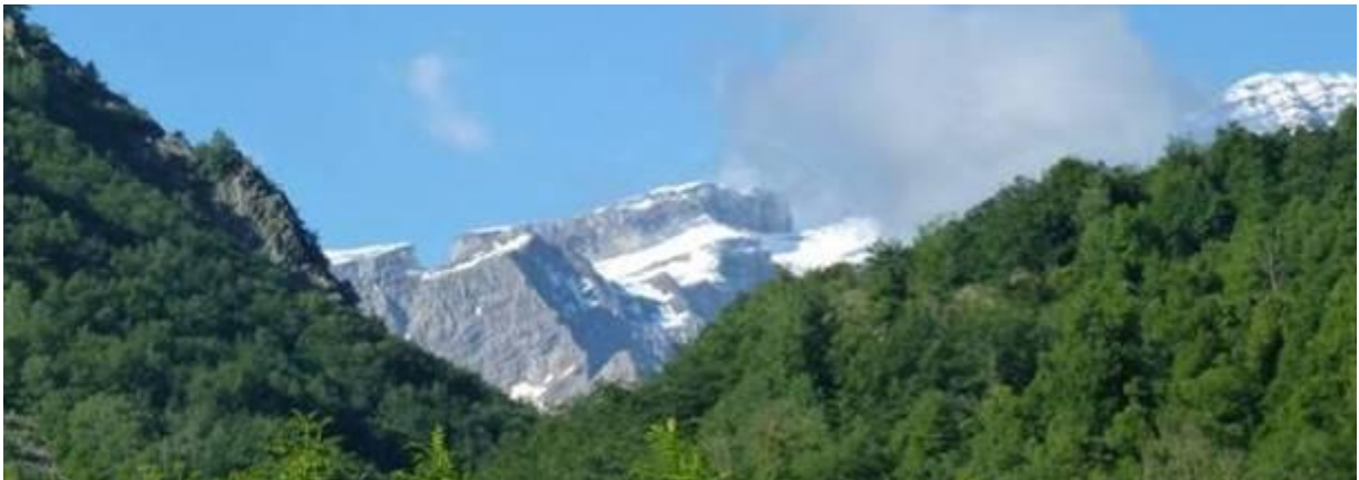
Above: the Brèche de Roland, from the Hotel La Brèche de Roland. The cloud is a reminder of the mixed weather this year.

The group in the rain at Gèdre-Dessus shows how it sometimes was!