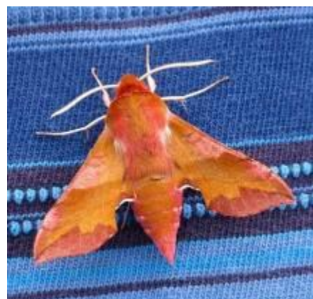
Purple-edged copper (C&OD) and small elephant hawkmoth (JC) (the blue is Chris's shirt)