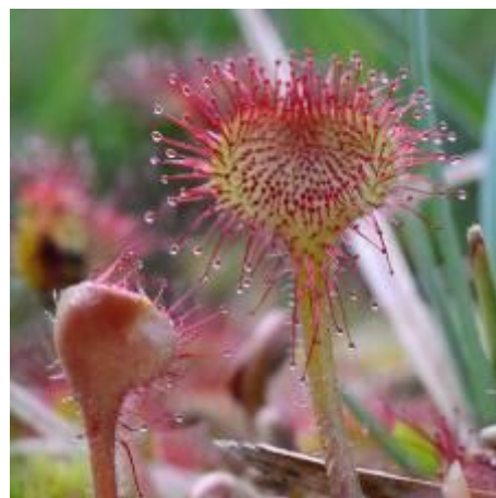
Round-leaved sundew (IN)

We took a short walk past the statue of the cyclist to look down the route we had taken to the top, and then we set off down again. The Glère Valley is only a short distance away yet it feels a very different place, with grazing horses and cattle on open grassland in between pine and beech woodland that provide a rich area for wildlife. Firstly though, we had a 'recharge' in the café Chez Louisiette before eating picnic lunches, and were entertained by our hostess chasing away a herd of cows, including throwing her broom at a bull. After lunch, some went their own way and others pottered in the rougher and sometimes wet areas of pasture that lead, rather like a golf fairway, into the valley. Oliver and Christine set off on a different route and were rewarded with views of citril finch, and Joan reported finding woodruff in the woods. The main group enjoyed two huge wood ant nests and watching impressive medicinal leeches alongside tadpoles in a small pond. In the wetter areas of grassland there were the tiny but distinctive leaves of round-leaved sundews – they took some finding – plus Tofield's asphodel, bog violet and scores of orchids.