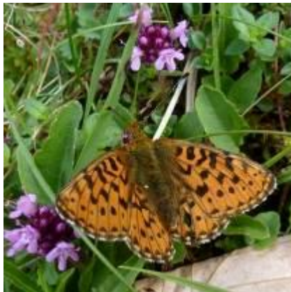
Pearl-bordered fritillary (CD)