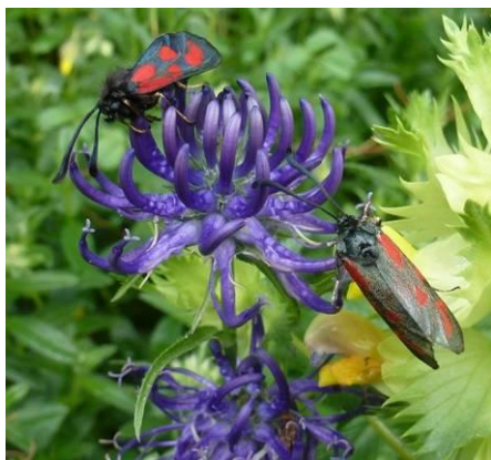
Six-spot burnet moths on a round-headed rampion (CD)

Where the road ends a path continues along the contour and gives a superb view of the Cirque de Gavarnie. We walked toward the cirque alongside meadows with sheets of horned violet, with alpine asters and burnt-tip orchids on drier patches. A red-underwing skipper posed beautifully on a narrow-leaved helleborine ... how apt it would have been if had been on one of the many butterfly orchids.