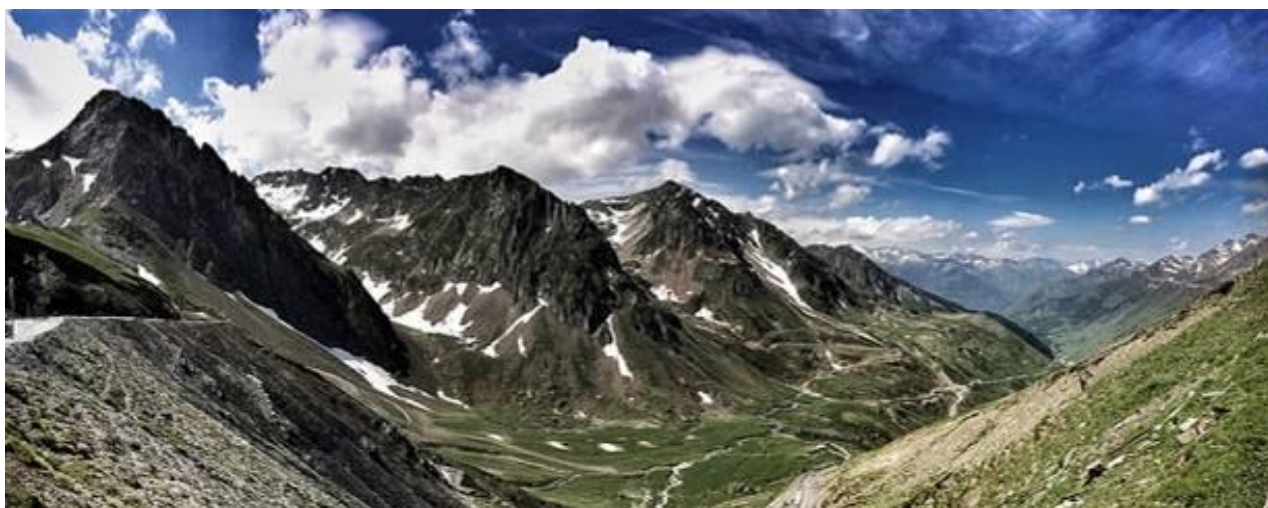
View from the Col de Tourmalet (IN)