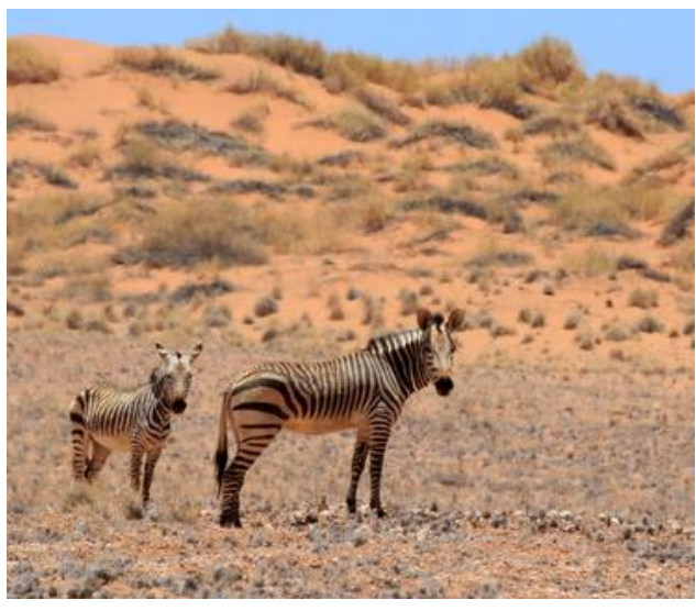
Hartmann's Zebras (GC)

Sossusvlei sand dunes, the big blue skies, Secretarybirds, Spotted Crake, seeing well over 200 bird species and 38 mammal species, reptiles ... the list goes on. Many photographs and thousands of great memories!