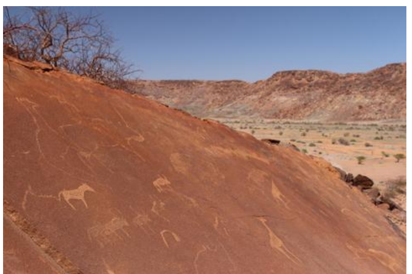
Rock engraving at Twyfelfontein World Heritage Site. (GC)

At the actual spring we saw quite a few birds, with Lark-like Bunting and Whitethroated Canary both being new for our trip list. We also saw a Boulton's Namib Day Gecko near the spring and Namibian Rock Agamas and Striped Skinks around the rock engravings.