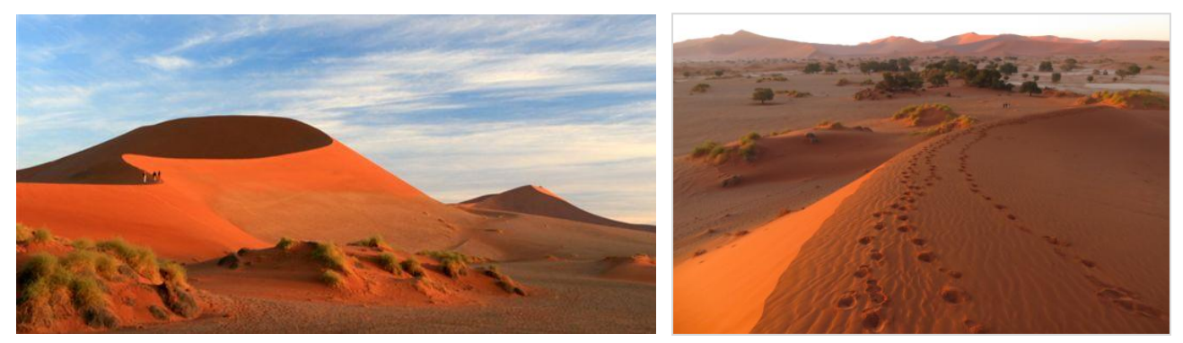
Sand dunes at Sossusvlei, and the view from the top. (KA)

We started the day way before dawn at 04:30 with a cup of coffee and a rusk. The small moon was over the horizon so we had some fantastic stars to look at: the Southern Cross, Orion's Belt, the Milky Way. The plan was to be at the dunes for sunrise to catch the beautiful colours, so the one-hour drive from the lodge to the dunes of Sossusvlei was in the dark. We jumped onto a 4x4 Landrover to take us through the sand to Sossusvlei. We climbed part way up the main big dune to get a better view of the changing light and colours on the red sand dunes, and Karin made it to the top.