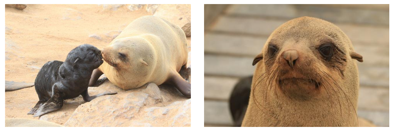
Cape fur seals. (GC)

Greater and Lesser Flamingos, Whimbrel, Curlew Sandpiper, Grey Plover, Avocet, Caspian and Common Terns, Hartlaub's, Kelp and Grey-headed Gulls and Ruddy Turnstone were on the mud in front of the lodge when we arrived. There were also some very large pink jellyfish waiting to be rescued by the incoming tide. Some of the group took advantage of the long promenade to stretch their legs and to watch the Common Dolphins.