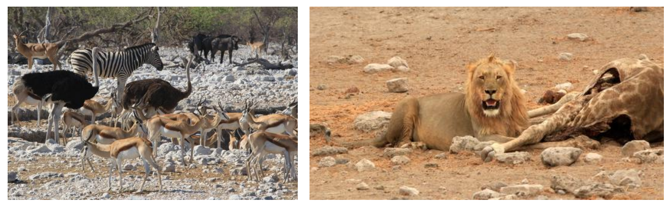
Left: Ostriches, Burchell's Zebras, Blue Wildebeest and Impala at a waterhole in Etosha NP. Right: lion on a Giraffe kill. (GC)

We doubled back to the Chudop waterhole where we found a lone Lion sitting at the waterhole; ten metres away was a dead Giraffe. There must have been at least 400 mammals of 8 different mammal species waiting to come to the waterhole to drink; Gemsbok, Black-faced Impala, Springbok, Kudu, Giraffe, Burchell's Zebra, Black-backed Jackal, Blue Wildebeest and Elephant. The Elephants were not afraid of the Lion and were happily drinking. A second Lion came in and settled down in the shade of a perimeter bush, which was then joined by the first Lion. We then headed back to camp for lunch and some down time, during which sitting at the waterhole was rewarded by a great view of a Black Rhino. Reading, sketching, swimming, photography and snoozing were also enjoyed.