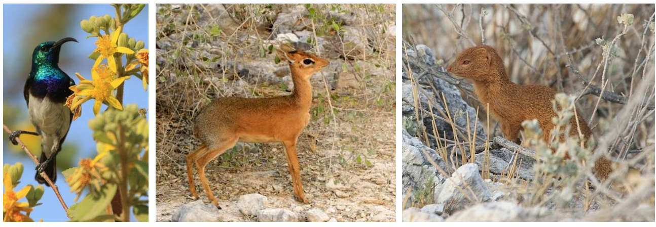
White-bellied sunbird, Damara Dik-dik and slender mongoose. (GC)

On the bird front we saw many birds. The new birds added to our holiday bird list were: Southern Pied Babbler, Woolly-necked Stork, Cape Vulture, Martial Eagle, Violet-eared Waxbill, African Pipit, Southern Grey-headed Sparrow, Cape Teal, Little Grebe, Pale Chanting Goshawk, Kori Bustard, African Jacana, Kittlitz's Plover, Three-banded Plover, Ruff, Black-winged Pratincole, Wood Sandpiper, Blacksmith Lapwing, Emerald-spotted Wood-dove, Red-billed and Yellow-billed Hornbills, Red-capped Lark, Barn Swallow, African Golden Oriole, Pied Crow, White-browed Scrub Robin, Damara Hornbill, Yellow Canary, Red-billed Buffalo-weaver, Amethyst Sunbird, White-bellied Sunbird and Little Stint.