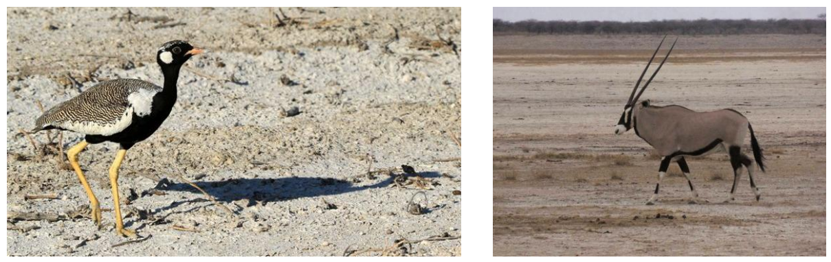
In Etosha NP – a Northern Black Korhaan casts a shadow (GC); and a Southern Oryx (Gemsbock). (BA)

This morning was overcast with rain clouds – but no rain. Before breakfast we went for a short drive, seeing a small herd of Eland with young by the Klein Namutoni waterhole. A large Plated Lizard was seen in the camp while we were loading up the vehicle with our luggage. We took a quick detour to the Chudop waterhole to see how the Lions were doing with the Giraffe kill. This time we had 10 mammal species at the waterhole; Lion, Gemsbok, Black-faced Impala, Springbok, Kudu, Giraffe, Burchell's Zebra, Black-backed Jackal, Blue Wildebeest and Black Rhino. Our route across Etosha via a number of waterholes showed us a few new mammals and birds. Two good sized herds of Red Hartebeest were seen and we saw plenty of Tree Squirrels at Halali Camp where we had lunch. New birds at the Moringa waterhole were Spotted Crake, Shaft-tailed Whydah, Black-throated Canary, Golden-breasted Bunting and Spotted Flycatcher.