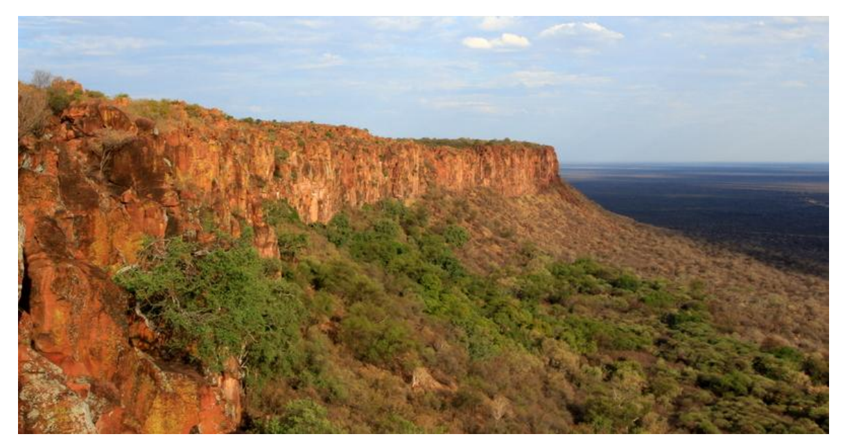
Waterberg National Park (GC)

After some R&R time we went for a walk through the forest below the sandstone cliffs. A group of Water Mongooses were foraging under the thick vegetation and a troop of Baboons was feeding in a huge old fig tree. Ruppell's Parrot, Rosy-faced Lovebirds, African Hoopoe, Fork-tailed Drongo, Red-billed Francolin, Crimson-breasted Shrike, Grey Turaco, Purple Roller, Burchell's Starling, Common Scimitarbill, Greater Blue-eared Starling and Groundscraper Thrush were seen during the course of the afternoon.