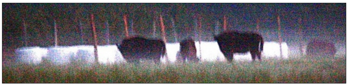
Bisons at dawn. The white glow is a line of silage bales.

and a re-count reveals there are 14. That's about the same number<sup>1</sup> as the group brought together in the 1950s to repopulate the forest after their extinction here. They move slowly away this time, disappearing from view behind some bales of silage wrapped in white plastic. It's now seven o'clock and we've been watching one of Europe's rarest mammals for just 15 minutes.