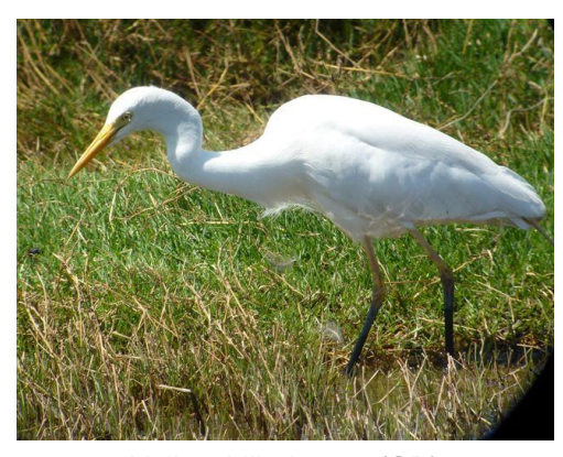
Yellow-billed egret (CD)