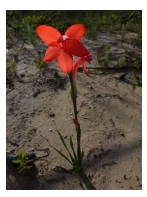
Klaas's cuckoo (HC); Napier Farmstead and Restaurant; Watsonia coccinea (CD)

Elim itself is a distinctive town where the buildings of the Moravian community are mostly the same simple style with roofs thatched with restios. However nowhere was open for lunch, so we needed a rather unwelcome drive along an unmade road to Napier, passing long-horned nguni cattle near to Elim. But the journey was well worth it: the Napier Farmstead and Restaurant was a delight with a menu including homemade butternut squash soup, pies and quiche, and with various local speciality foods for sale. After that we took a longer but metalled road back to Elim, passing and giving a chance to scan several roadside wetlands. Highlights here included two very close blue cranes, white-backed ducks, a harrier hawk and adjacent three-banded and Kitlittz's plover.