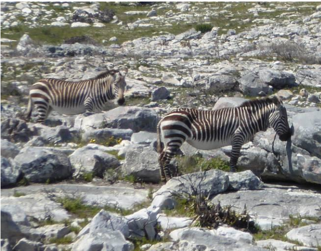
African penguins at Boulders beach, and two of the Cape Mountain zebras on the nature reserve (HC)

We moved on to the open expanses of the Cape of Good Hope Nature Reserve, a mix of vegetated sand dunes with rocky outcrops, where the poor soils meant no trees but plenty of scrub, including patches of proteas. Among some large boulders four Cape Mountain zebras stood stock-still: one of Africa's rarest mammals, with just seven in this area out of a total population of just 230 animals, Geoff said. With their pale bellies and brownish stripes without 'shadow' stripes they were distinctly different from the better-known Burchell's or plains zebra.