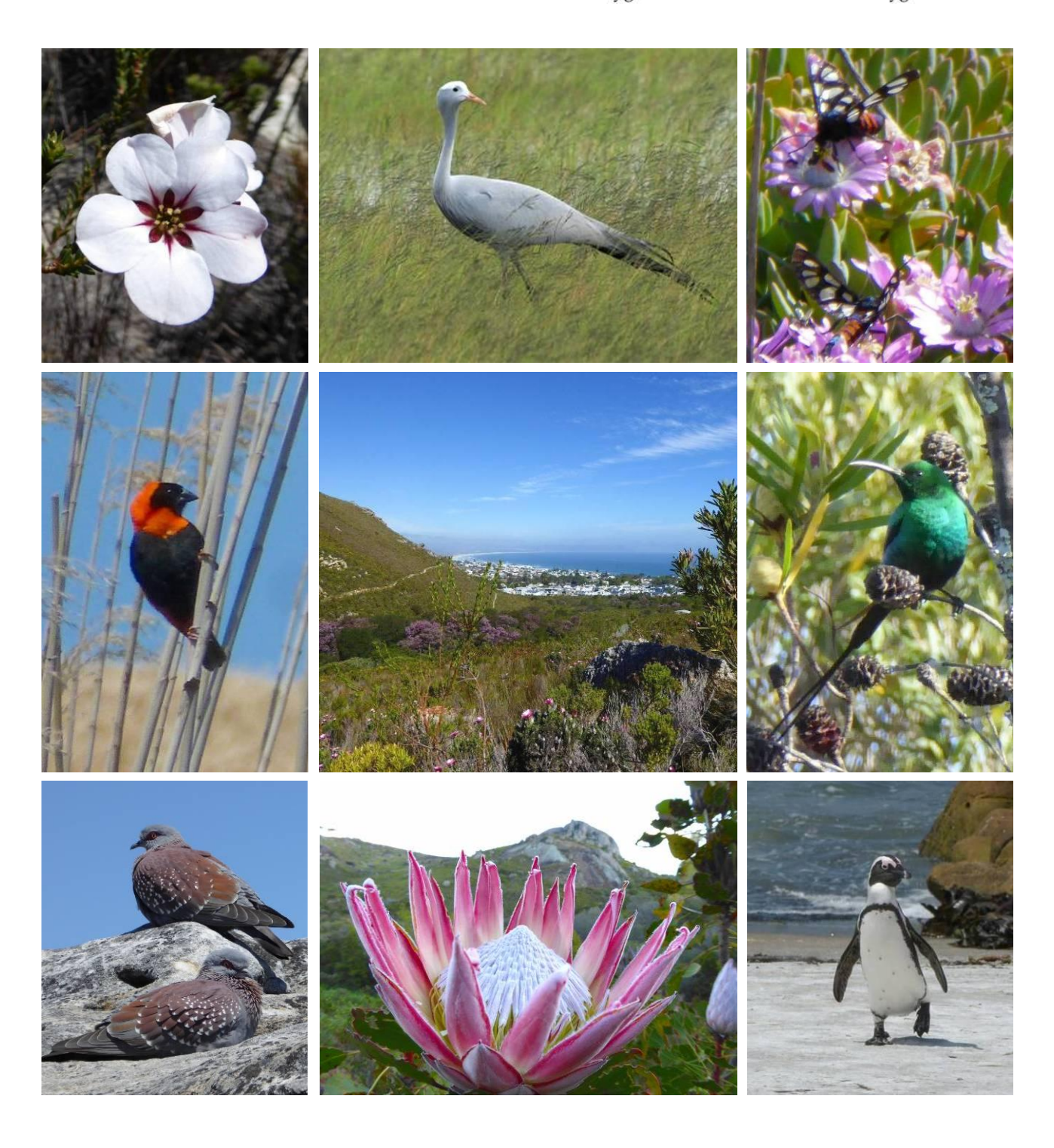
South Africa's Southwest Cape 7 – 22 October 2015