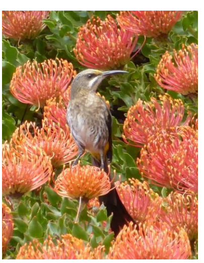
From Kirstenbosch: Southern double-collared sunbird (HC); the tree-top walkway (MC); sugarbird on pincushion protea (MC)

Geoff left us to move the minibus and our picnic lunch near the Ryecroft Gate, where we walked to meet up, seeing along the way striped mouse and a carpenter bee with two broad yellow stripes – a female Xylocopa caffra . Helen found a stick insect in the loos, which she brought out to be studied and photographed by us all, especially as it walked over David. Later study showed it to be a male Thunberg's stick insect Macynia labiata . After lunch we strolled through a different area, where three swee waxbills settled on the grass. A large leopard tortoise was completely untroubled by human attention. Our route then went into a more wooded, natural area where a stream had Cape river frogs and one corner had a very tame dusky flycatcher. The path led us past strelitzias and coral trees to an area specialising in rare and threatened plants, beyond which we passed a wedding party. After taking in the specialised plants in the conservatory (e.g. desert plants and bulbs) and browsing in the shop, we had an early return for tea and a rest back at Tarragona Lodge, then wildlife checklists and eating out in Hout Bay at Massimo's.