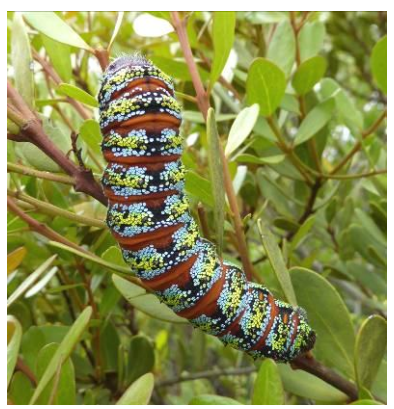
From the West Coast National Park: Silver arrowhead butterfly; white-throated swallow with a nest in the hide; and a caterpillar of the pine emperor moth (HC)

Moving on, a different harrier hunted over the scrub, the striking-looking black and white of a black harrier. The picnic tables by the National Park's main building were being used so we drove on, pausing to watch southern black koorhaan (a bustard), the second of what Geoff had suggested were our target species, the first being the black harrier. Lunch was at a hilltop viewpoint over the extensive Langebaan coastal lagoon. Growing here were the knee-high white spikes of a chincherinchee, the star-of-Bethlehem Ornithogalum thrysoides , and a charming little iris Babiana tubiflora . A colourful find was lunate ladybird and there were repeat sightings of several bird of prey species.