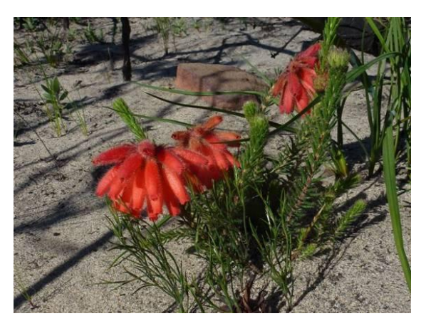
Oxalis polyphylla and Erica cerinthoides under burnt protea scrub at Silvermine (CD)

After an hour back at base, Geoff collected us for our evening meal at the nautically-themed seaside fish restaurant Mariner's Wharf. Very good it was too, with a killer quote from one of the waiters who discovered the family connections in the group: "You're witnessing your grandfather having a tart? It's awesome!"