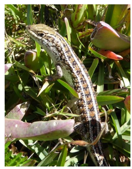
Western three-striped skink

Heading home, we had two mammal stops. The first was for a single bontebok, opposite the ostrich farm, with a group of half a dozen a little farther along. The second was a family group of chacma baboons, one of which had a radio collar and tags. Later we saw a baboon minder with a different group, prepared to intervene if the baboons caused a problem to people.