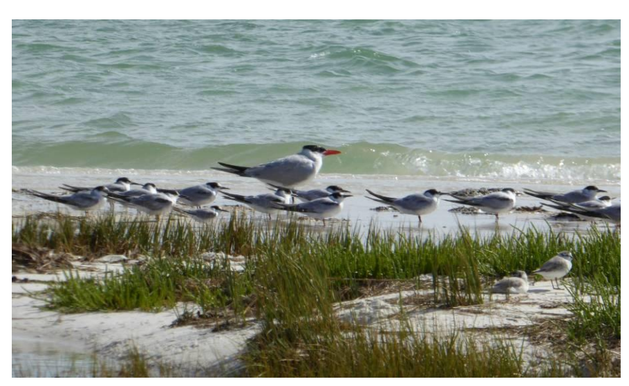
Terns and two white-fronted plovers on the shore of Langebaan lagoon, West Coast National Park (HC)

Moving on, a different harrier hunted over the scrub, the striking-looking black and white of a black harrier. The picnic tables by the National Park's main building were being used so we drove on, pausing to watch southern black koorhaan (a bustard), the second of what Geoff had suggested were our target species, the first being the black harrier. Lunch was at a hilltop viewpoint over the extensive Langebaan coastal lagoon. Growing here were the knee-high white spikes of a chincherinchee, the star-of-Bethlehem Ornithogalum thrysoides , and a charming little iris Babiana tubiflora . A colourful find was lunate ladybird and there were repeat sightings of several bird of prey species.