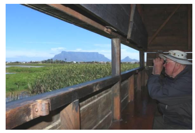
Looking over Rietvlei Nature Reserve (GC)

That left four of us to carry on to the marshes of Rietvlei Nature Reserve, overlooked by Table Mountain. The lagoons had white pelicans, flamingos of two species (greater and lesser), glossy ibises, African spoonbills, hundreds of red-knobbed coots, black-winged stilts and various herons, including vellow-billed egret. Nesting underneath both hides were white-throated swallows. The most numerous small bird was the sparky Levaillant's cisticola, and others included red bishops and two weaver species. There was a chilly breeze over the water around the two hides but much warmer as we made our way back through the vegetated dunes. In an open bush a pin-tailed whydah sat in good view, tail and all; two black-shouldered kites hovered over open areas and two African fish eagles drifted through. Butterflies