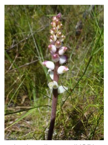
Lachenalia peersii (CD)

After breakfast at Baleens, we spent a 'free morning' in Hermanus. Inevitably this involved some shopping and coffee, but mostly for all of us it meant walking along the seafront and looking for, or at, whales, The best of these were around midday when two southern right whales, probably a mother and calf, were close to shore and the bigger one was regularly breeching. There was quite a crowd of appreciative onlookers. Elsewhere there were gulls, including our first definite greyheaded gulls, and terns, notably Sandwich and swift. The coastal path had an easy walk with information about the wildlife and vegetation plus incredibly tame rock hyraxes. We split up after our 12:30 rendezvous, leaving three behind to continue enjoying Hermanus, and the rest of us took a very short drive to Fernkloof nature reserve where we ate our picnics. For the now guite hot afternoon, we walked through the fynbos vegetation at Fernkloof. Almost immediately there was an orange-breasted sunbird and amazing views of a very tame sugarbird. But the fine show of fynbos flowers was the main attraction. Listing these was helped by a display of labelled, picked flowers behind a door kept locked to keep out the local baboons (which didn't show).