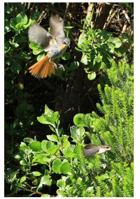
Cape robin-chat mobs a boomslang (GC).

Harold Porter Botanical Gardens, where we had lunch outside, was just 10 minutes away. Quick to come to