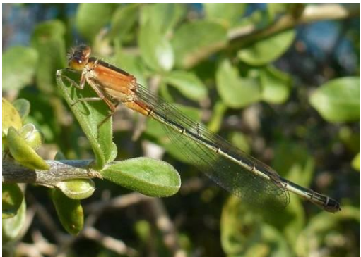
Satyrium carneum, worth the scramble; the Atlantic coast from Chapman's Peak Drive; immature female Tropical Bluetail (CD)

Next stop was a viewpoint with breathtaking views of the coastline. What first looked like a whale in the bay was just a rock, but there was lots to see: a particularly fine plant was the green and cream flowered Albuca capitata <sup>2</sup>. A damselfly settled, allowing photographs, from which an ID of Tropical Bluetail was clinched. Moving along the coast the road dropped down and we joined several other people watching a southern right whale at Simonstown, very close to the Indian Ocean shore. It was an easy walk, over a railway line, and I also spent time pursuing a dragonfly that photos revealed to be a female Two-striped Skimmer.