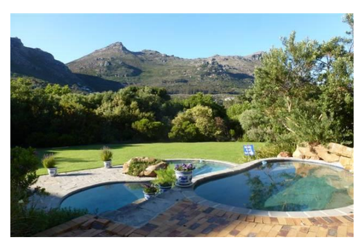
The garden at Tarragona Lodge (CD)

We stayed at In Hout Bay: Tarragona Lodge www.tarragona.co.za In Hermanus: Baleens Hotel www.baleens.co.za