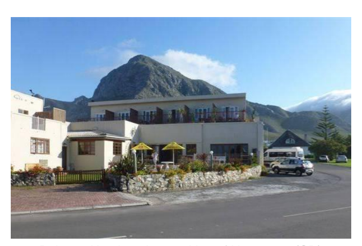
Baleens Hotel on the outskirts of Hermanus

This holiday, as for every Honeyguide holiday, also puts something into conservation in our host country by way of a contribution to the wildlife that we enjoyed. The conservation contribution this year of £40 per person was combined with those from Honeyguide's group in Namibia in November 2015.