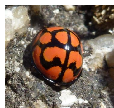
Arum lily frog (CD); Southern rock agama (HC); lunate ladybird (CD)