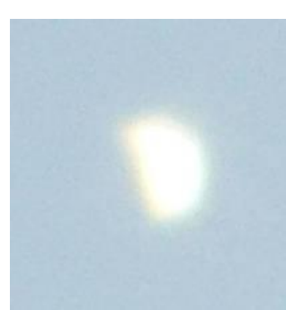
Telescope view of the 'morning star' (CD)

Our departure was slightly delayed as Helen's sharp eyes had noticed a light in the blue, almost cloudless sky, which a telescope view confirmed as Venus with its semi-circle shape visible.