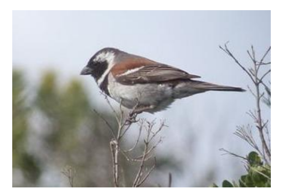
Cape sparrow (CD)

Cape bunting a remarkably tame bird at Cape Point on 9/10, W Coast NP 13/10, Rooi Els 16/10.