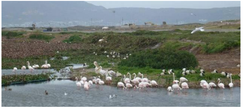
Flamingos, pelicans, ibises and more at Strandfontein (CD)

It was a short drive to the extensive water purification lagoons at Strandfontein, which was mostly stop-start birdwatching using the minibus as a mobile hide as there were huge numbers of birds, often very close. Greater flamingos were in thousands and there were many hundreds of sacred ibises, which were also with gulls feeding on the adjacent rubbish tip. There were several purple swamp-hens, mostly on vast sheets of water hyacinth, and a black crake walked in the open