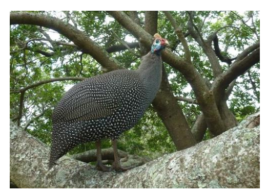
Helmeted guineafowl (CD)