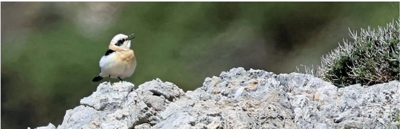
“A superb male black-eared wheatear” (DB).

On our way to Phaestos we stopped off at the now opened Kourtaliótiko Gorge where we had good views of two griffon vultures, a pair of nesting kestrels and a brief view of a male blue rock thrush. The highlight here was a superb male black-eared wheatear. On the way to Phaestos we passed carpets of spectacular turban buttercups on the roadsides.