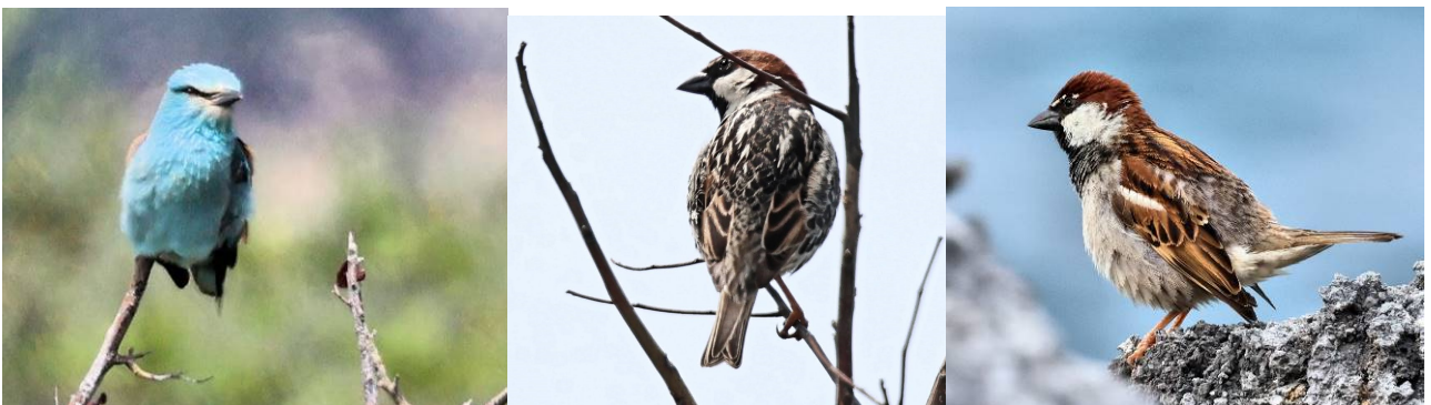
Roller and male Spanish sparrow at Frangocastello; male Italian sparrow, Souda, for comparison (DB).

Many species of butterflies were on the wing including a host of swallowtails plus wall browns and clouded yellows. We were still searching for new plants and found rayless chamomile, pale bugloss, flowering caper in the telescope and a super patch of love-in-a-mist as well as a single specimen of yellow pheasant's eye. With the day warming up, we stopped at a beachside taverna for coffees and fresh orange juice. Seven little egrets flew eastwards offshore and a splendid male white wagtail perched up in full view. We had our picnic lunches by the fort with two more purple herons going over; white henbane was in flower by the fort entrance.