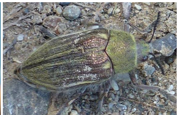
Two interesting invertebrates at Kalamaki. Tamarisk peacock moth on the minibus, which was parked under tamarisk; Cretan jewel beetle Julodis pubescens ssp. yveni .