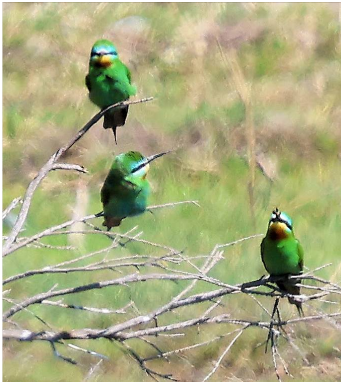
Blue-cheeked bee-eaters (DB).

After lunch we strolled up to the pools and had hardly gone any distance when we spotted a movement in the bushes which revealed itself as a male subalpine warbler!