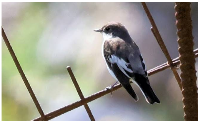
Birds on the fence at Moní Préveli: whinchat and pied flycatcher (DB).

Making our way back up the track most of the group went for a look around the monastery (plus they have good loos!) while the others searched the scrub further down the road. Several Sardinian warblers were in full song flight clearly showing their black heads, white throats and red eyes. More migrants were soon located including a singing nightingale in thick cover, two female pied flycatchers and a female redstart. Best of all was a male ortolan bunting in full song and flitting from rock to rock, occasionally being joined by a female. High overhead five alpine swifts passed over while a sparrowhawk was hunting along the ridge – quite a morning!