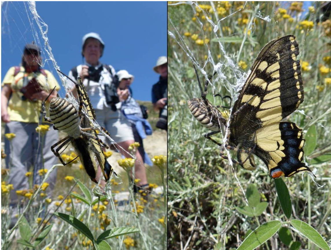
Swallowtail trapped by banded argiope, a wasp spider.