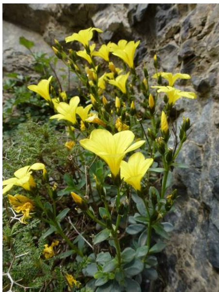
Tree flax, Kotsifou Gorge.

After a break in the middle of the day, we reconvened in the car park and walked up the road to see the tiny, delicate, solenopsis on a roadside bank. Its flowers were only just opening but we also found lesser snapdragon, lots of Jersey toadflax and yellowwort. Our next stop was at Kotsifou gorge – after a detour up a windy road into Sellia due to traffic chaos in Plakias! As we passed through the village, a hoopoe flew across the road and we made a brief stop to search unsuccessfully for Ruppell's warbler.