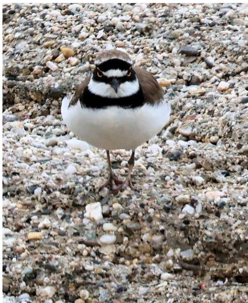
A little ringed plover, with attitude, at Souda (DB).

the best sites for this near-endemic species. Many other plants were found here including spiny golden star, thorny broom and four more naked man orchids. David B spotted a male blue rock thrush, a kestrel was eating prey on the wing, but the real highlight was the spectacle of 70 odd griffon vultures soaring together over the nearby cliffs!