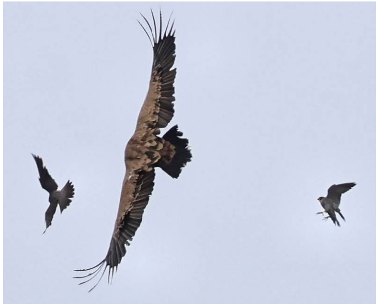
Chukar; a griffon vulture is mobbed by two peregrines (DB).