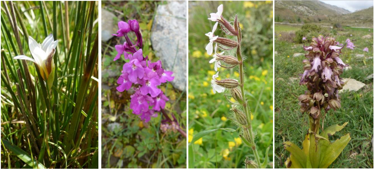
Crocus sieberi ; four-spotted orchid Orchis quadripunctata ; small-flowered catchfly; giant orchid at Spili Bumps.