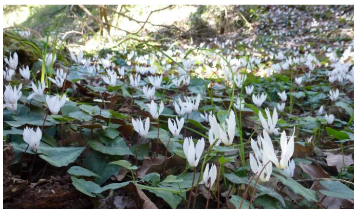
Cretan festoon by the roadside in Myrthios; Cretan cynamens.

Lunch was taken at Taverna Dionyssos with spectacular views across the bay. Before heading off to Kanevos, everyone had great views of three butterflies: swallowtail, Cretan festoon and wall brown. On our way to Kanevos we stopped briefly at Kotsifou Gorge where a minimum of seven griffon vultures were coming and going onto the cliff ledges.