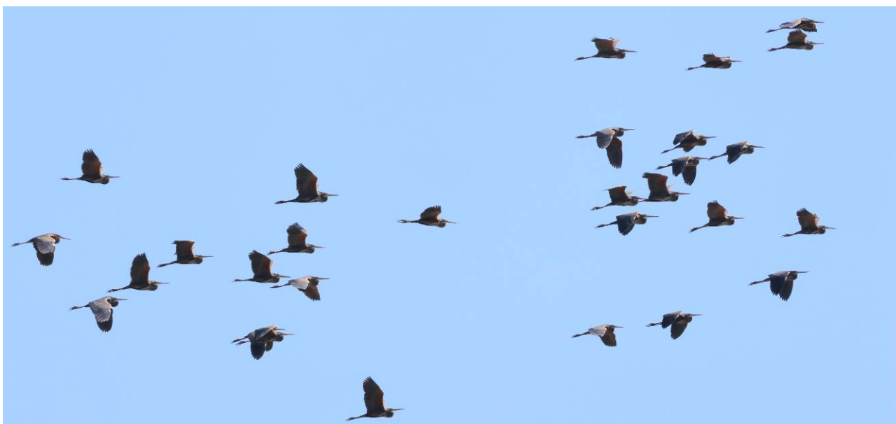
Purple herons.

Our final port of call was at Katyaki lagoons, near Timbaki, which had turned into a very full lake thanks to the aforementioned heavy rain. As we disembarked the lagoon side vegetation was full of teneral red-veined darters while sharp eyes picked out a few blue-tailed damselflies. Three male shovelers were on the lagoon, and the lake edges supported two common sandpipers and a wood sandpiper. Best of all was a squacco heron which Jo spotted in thick cover. At that moment 43 purple herons emerged from the nearby reedbed with a single night heron – an extraordinary spectacle over the lagoons! A large flock of sheep arrived in nearby fields with a cattle egret hitching a ride on their backs. A great day's birding on the south coast of Crete was brought to an end as we began the long drive back to Plakias. Dinner this evening was at Taverna Sirocco.