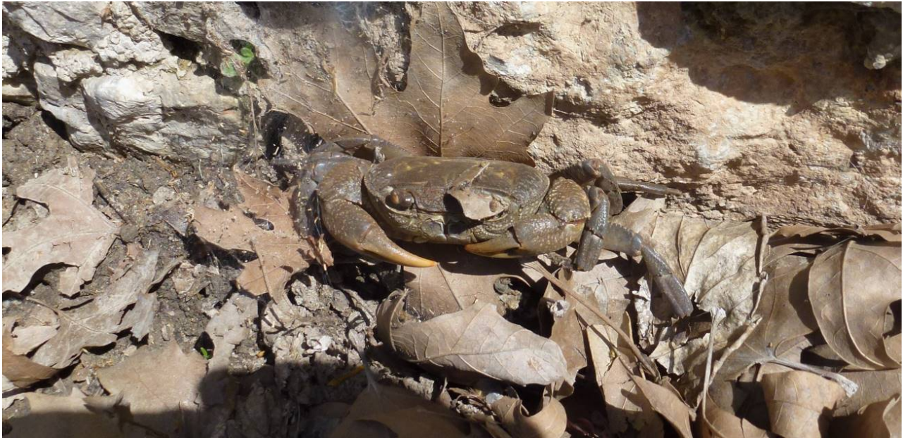
Freshwater crab, also known as land crab, Potamon potamios , Turkish Bridge near Moní Préveli, 11 April.