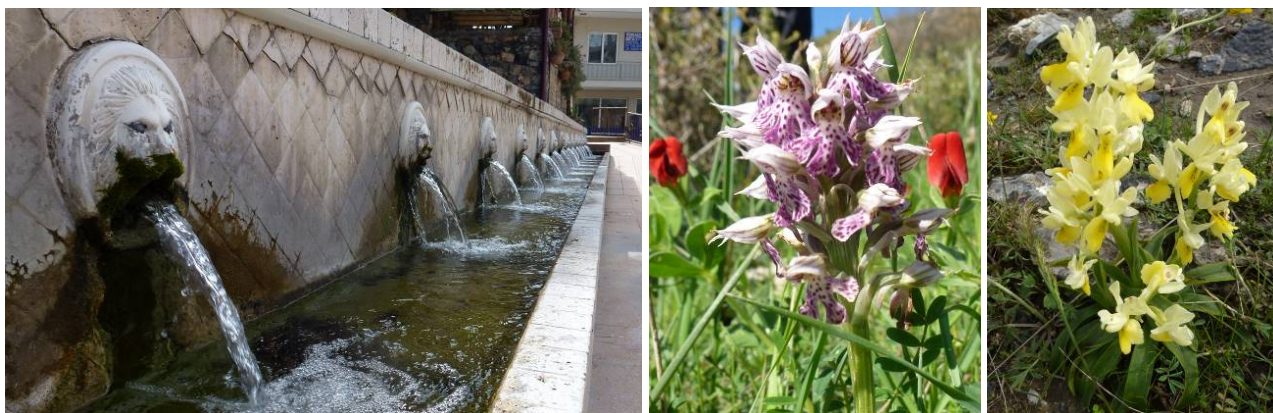
Fountains at Spili; milky orchid, often a species that has finished flowering for our visits; few-flowered orchid.

Moving on we parked up in the main car park at Spili where four red-rumped swallows were circling overhead. We had our picnics in the main square by the Venetian fountains and filled water bottles from the crystal-clear water. A red admiral was attracted to the nasturtiums.