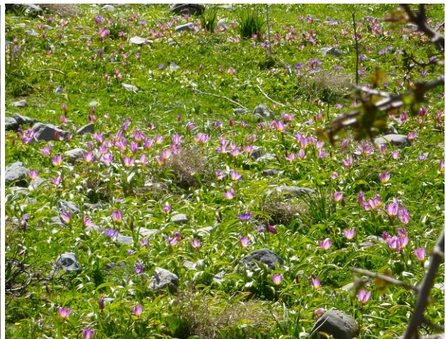
Southern darter Sympetrum meridionale , Agia Reservoir. The lack of markings on the thorax separates it from common darter; pale shoulder stripes are another feature. Tulipa bakeri on Omalós plateau.

We began the long and winding road up to the Omalós plateau, noting both red-rumped swallow and woodchat shrike on the way, before stopping for coffee in the café with the stuffed bearded vulture. We had our picnic lunches on the roadside by superb display of pink tulips Tulipa bakeri ; there must have been a couple of thousand flower spikes here, though here many were still in bud.