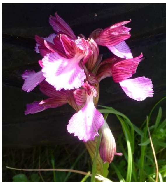
Pink butterfly orchid: the black background is old tyres.

After lunch we headed north to Honeyguide's secret valley. We parked on the roadside and began looking for plants with lots of fresh naked man orchids on show and an impressive set of three large loose-flowered orchids. We then walked up a farm track encountering eight more orchid species including many fan-lipped (or hill) orchids, yellow bee orchids, milky orchids and a single pink butterfly orchid growing among a dump of old tyres. Other plants such as buckler mustard, yellow vetchling and blue hound's-tongue were in full flower. Moving further up into the valley we had a look over a disused quarry where a singing serin was in full view atop a large downy oak tree, to complete another excellent day! Dinner tonight was rather a hurried affair at Taverna Gio Ma as Easter Sunday approached!