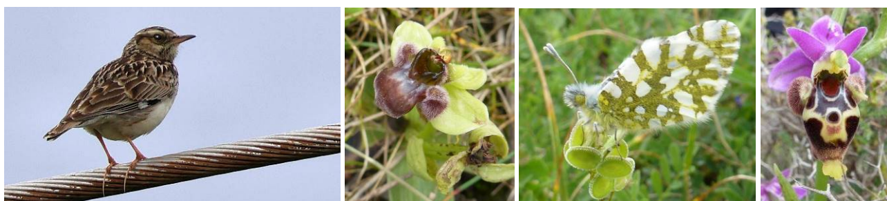
Woodlark on a wire; bumblebee Ophrys ; eastern dappled white; Ophrys heldreichii (marengo orchid).

The afternoon saw us arrive in good time at "Spili Bumps", a botanical haven. Our first find was Mediterranean red bartsia and then it was mostly about the orchids, with 14 species being recorded. Very fresh naked man orchids seemed to be everywhere and we also quickly spotted man orchids, early spider orchids, a few milky orchids and marengo orchid. The spectacular Cretan iris was in flower here and carpets of one-flowered clover were found on the hillsides. Other wildlife was not to be forgotten as we had great views of a singing woodlark on the wires, and an eastern dappled white butterfly perched on a buckler mustard showing its distinctive underside.