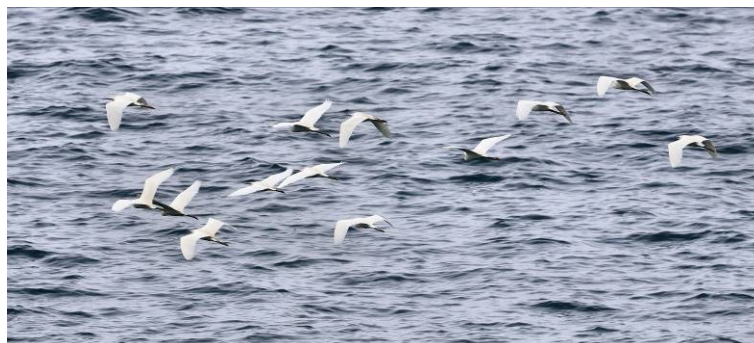
Little egrets over the sea (DB).

Our next stop was at Souda, just west of Plakias, where we admired some magnificent specimens of Cretan palm, at one of