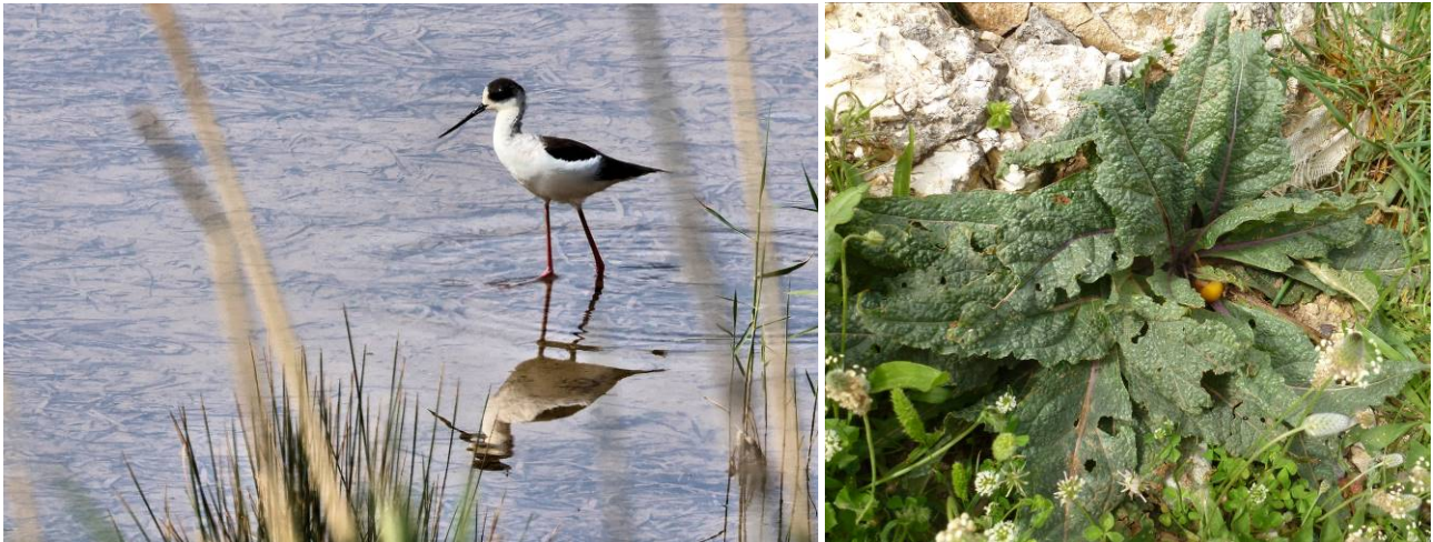
Black-winged stilt (DB): mandrake.

The Venetian fort was built between 1371 and 1374 but its main claim to fame is the massacre of Cretan forces here by the Ottoman Empire on 17 May 1828. Many of the turks were killed by rebel ambushes launched from the local gorges. It remains a mystery as to why they occupied the fort instead of attacking Ottoman forces from the surrounding countryside! Tradition has it that those Cretan forces called Drosoulites are seen to march towards the fortress around dawn on the anniversary of the battle.