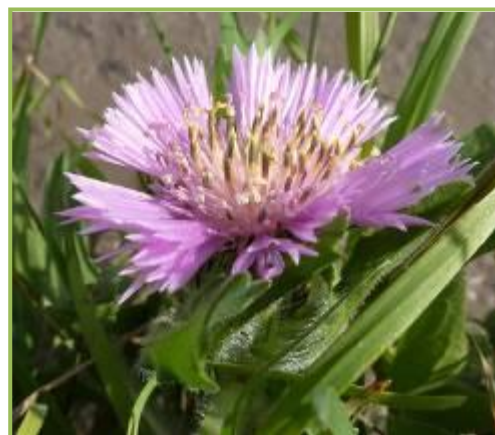
Paperwhite narcissus; Drosophyllum lusitanicum ; Centaurea pullata