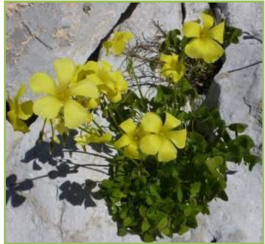
Barbary macaque, and Bermuda buttercup growing out of a limestone cleft.

We then headed down the hill, which is a slow and steady walk on a quiet road that today took us 2¼ hours. Sardinian warblers clacked and a possible rock thrush was seen, but it was pretty quiet for birds apart from these and the ubiquitous yellow-legged gulls. But the now hot afternoon sun brought out Iberian wall lizards and butterflies, notably Cleopatras and Spanish festoon, and one or two violet carpenter bees. The flowers were interesting and the timing was good for some regional or local specialities. We found the Iberian friar's cowl Arisarum simorrhinum and lots, again, of the Andalusian birthwort, two sometimes confused species. Shrubs included lentisc, Mediterranean buckthorn, scrubby scorpion vetch and shrubby germander Teucrium fruticosus . Rather local specialities were toothed lavender Lavandula dentata and the orange-centred yellow flowers of rock marigold Calendula suffruticosa and, on the point of flowering, giant Tangier fennel Ferula tingitana . Naturalised freesias grew in several places.