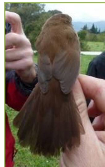
Brian helps to weigh, measure and check the condition of the ringed birds. A Cetti's warbler from behind, showing its rounded tail and short wings.

A group of crag martins flew over us, and other hirundines, too. Angela and Sue took the short walk round the garden to scan the estuary, returning with news of the osprey we'd struggled to see from the other side. The rest of us then thanked and left the ringers, and were soon also enjoying superb views of the osprey from a substantial, if underused, two-tier concrete viewing platform. There were also greenshanks, spoonbills, marsh harriers and other estuary birds, and a great spotted cuckoo flew low overhead.