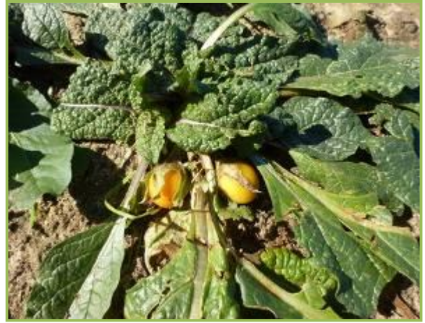
Mandrake, with two plump fruits.