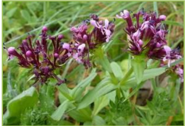
Glossy ibis behind some barbed wire at Barbate; fedia, a tiny valerian.

Moving on, we pulled up to park by the entrance to a depuradora (water purification plant) where Ann noticed a bird fly off that could only have been a black-shouldered kite. It reappeared a few minutes later, hovered over the marshes, flew right over us, continued to fly in sight for a while and was joined by another. Those who'd looked for a bush down the short path to the marshes of the river Barbate returned with news of good birds. They were still there after we'd enjoyed gazpacho and Frank's picnic spread: about 40 black-winged stilts, a close glossy ibis and several purple gallinules on a superb, flooded area of marsh. Shovelers, moorhens and several chiffchaffs added to the mix, then many more glossy ibises and purple gallinules a little farther on. Here we were overlooking an area of marsh managed for nature by Frank's farming family. We stopped for a brief gossip with Stephen Daly, a bird guide who lives locally.