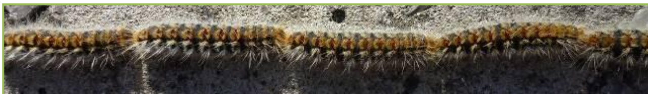
Pine processionary moth caterpillars in Gibraltar.

We were away immediately after breakfast in a convoy of three minibuses, as I needed to drop mine at Hertz in Algeciras before piling into Katrin's bus for the last leg to La Linea. After saying farewell to Frank and Katrin we took the short walk across the border to the new Gibraltar airport terminal. The incoming easyJet flight was late due to freezing fog at Gatwick, a reminder of the winter we'd left behind, but much of the time was made up on the return flight.