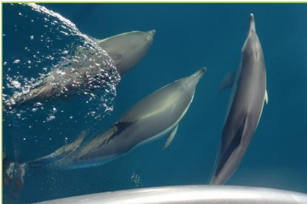
Three of the nine common dolphins by the boat.

The whale-watching company we'd used previously wasn't running in February, so instead we tried a dolphin-watching company operating out of Gibraltar, combined with our day on the rock. After parking in the underground car park in La Linea, we walked across the border and the airport runway and were met by Fiona from Dolphin Safari. We were away by 11 o'clock on, in effect, a private charter for the 13 of us. The boat's crew soon noted some gull activity, which is often linked to dolphins and so it proved. There was a pod of nine common dolphins that seemed to enjoy surfacing and swimming under the boat, offering superb views of this gorgeous marine mammal.