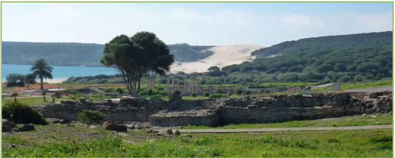
The Roman town at Bolonia, with a natural sand dune sweeping up the hillside beyond.

Our final stop today was Bolonia cliffs, a little farther up the road, passing gum cistus scrub, just one bush of which had flowers. Two hoopoes perched obligingly on a roadside wire. A crag martin failed to hang around for all to see and the ravens were a rather brief fly-past, but blue rock thrushes put on a good show for all. There were also glimpses of a rock bunting, but not so the whole group could see it.