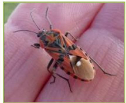
Paper wasps Polistes sp. and nest on the underside of a dwarf fan palm; emerging caterpillars of Ocnogyna baetica , the winter webworm moth; and a ground bug Spilostethus pandurus .