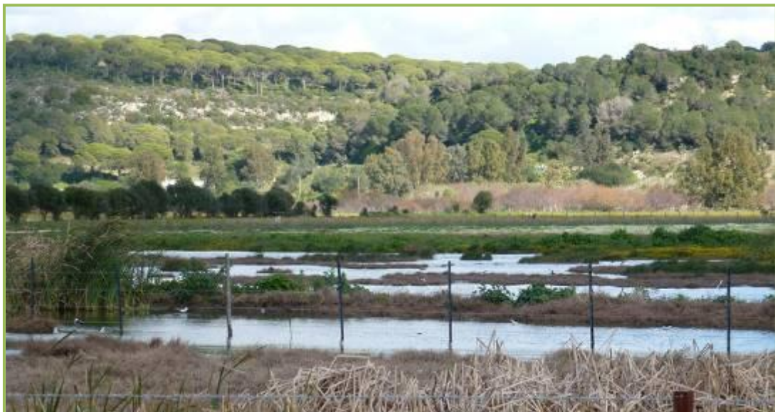
The stilt marsh by Barbate river. Note the umbrella pines on the hillside.

Moving on, we pulled up to park by the entrance to a depuradora (water purification plant) where Ann noticed a bird fly off that could only have been a black-shouldered kite. It reappeared a few minutes later, hovered over the marshes, flew right over us, continued to fly in sight for a while and was joined by another. Those who'd looked for a bush down the short path to the marshes of the river Barbate returned with news of good birds. They were still there after we'd enjoyed gazpacho and Frank's picnic spread: about 40 black-winged stilts, a close glossy ibis and several purple gallinules on a superb, flooded area of marsh. Shovelers, moorhens and several chiffchaffs added to the mix, then many more glossy ibises and purple gallinules a little farther on. Here we were overlooking an area of marsh managed for nature by Frank's farming family. We stopped for a brief gossip with Stephen Daly, a bird guide who lives locally.