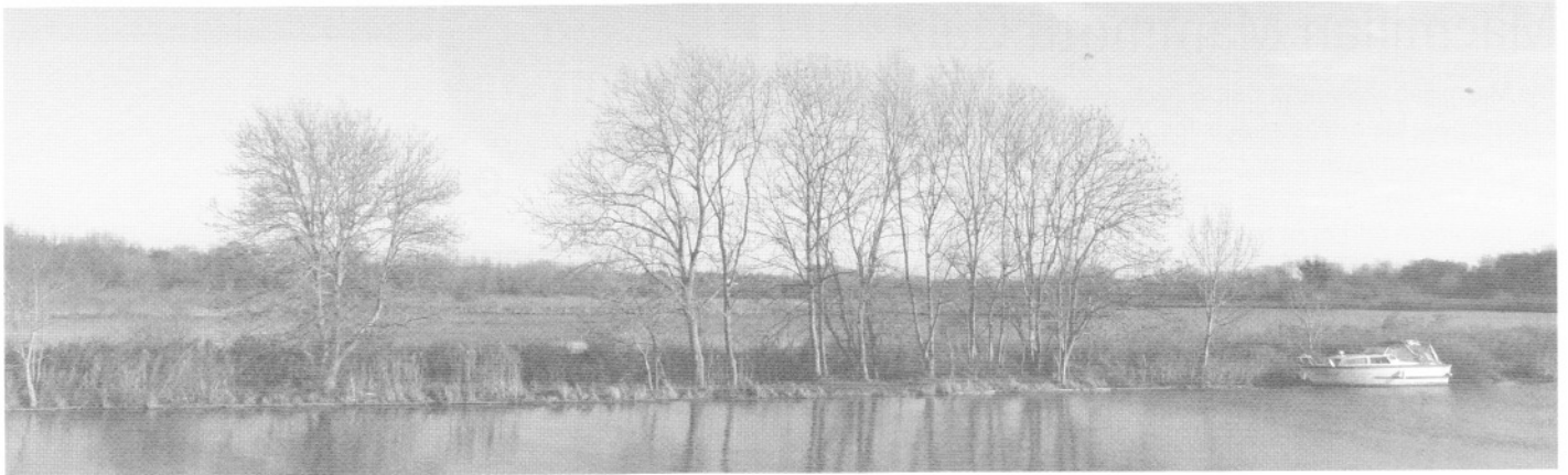
St Andrew's Broad at Thorpe Marshes, from Whitlingham Country Park.