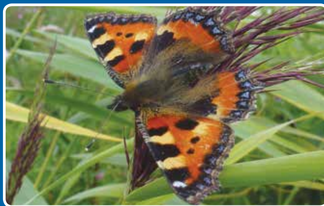
(above) Small Tortoiseshell (below left to right) Brimstone, Silver-studded Blue, Narrow-bordered Bee Hawk-moths, Glanville Fritillary

Sign up to All Aflutter – Butterfly Conservation's free monthly email newsletter – to discover how to help butterflies in your garden, learn to identify butterflies, moths and the best places to look for them and find out how Butterfly Conservation saves endangered species.