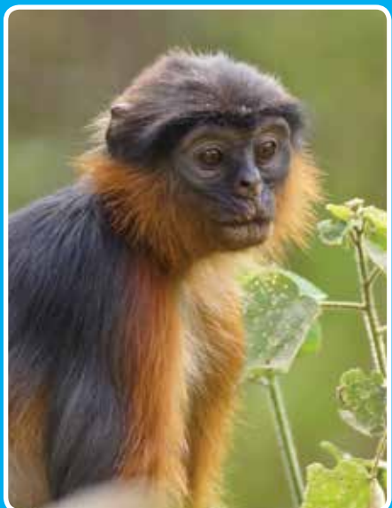
Red colobus monkey