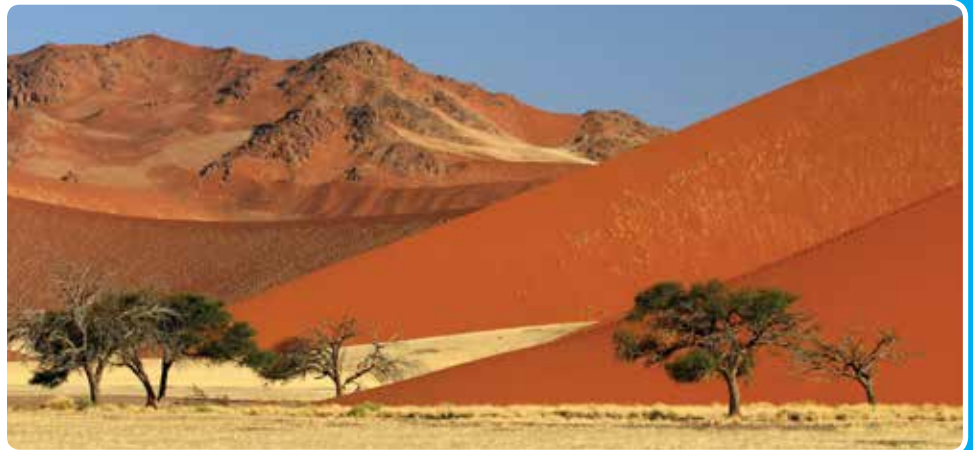
Dunes at Sossusvlei

The famous Skeleton Coast – so named because of the many shipwrecks – holds the Cape fur seal colony at Cape Cross, the largest in the southern hemisphere and home to about 200,000 seals in peak season. Walvis Bay lagoon is regarded as one of the most important wetlands along the