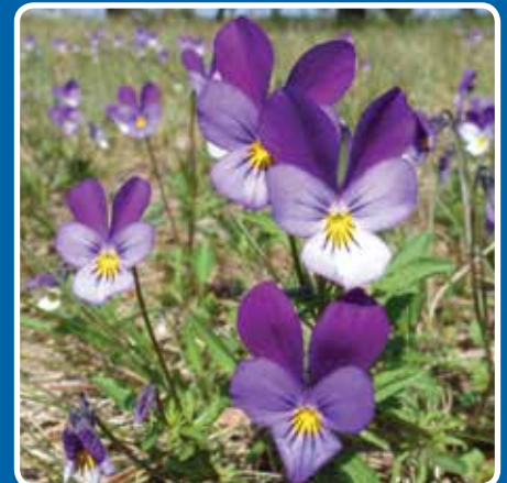
Wild pansy Viola tricolor