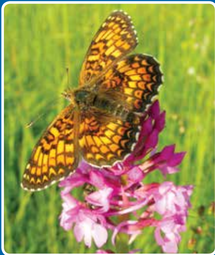
Knapweed fritillary on pyramidal orchid