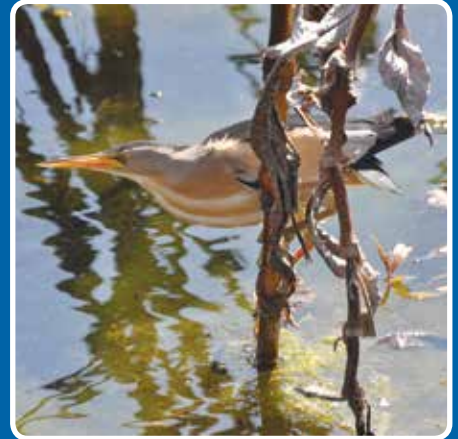
Little bittern at Ayia Reservoir