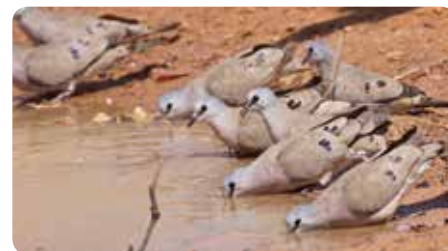
Black-billed wood dove

Hides around the watering holes of Kiang West National Park will bring us up close to laughing doves, speckled wood doves and maybe even wintering European turtle doves. They can also bring views of some of the park's mammalian residents such as bushbucks, warhogs, and with extreme luck some of the park's reclusive wildcats such as serval or caracal.