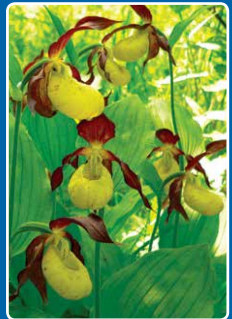
Lady's slipper orchids