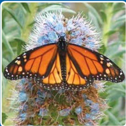
Monarch on pride-of-Madeira