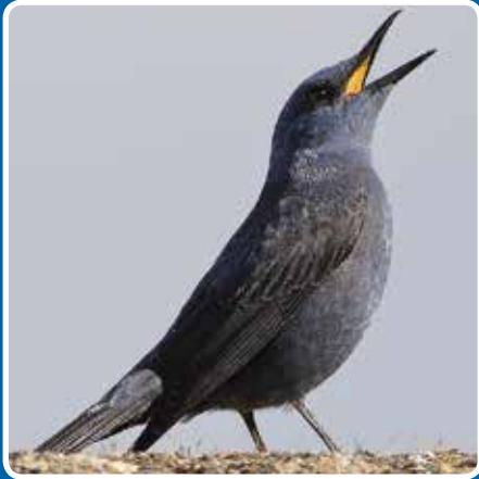
Blue rock thrush