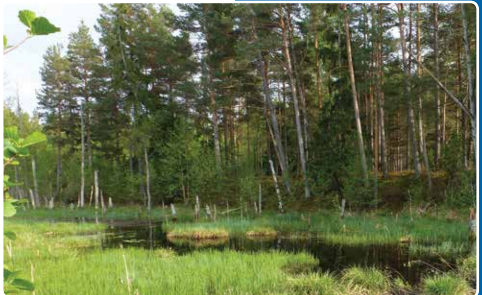
Kolka roadside bog

More information visit www.honeyguide.co.uk 11