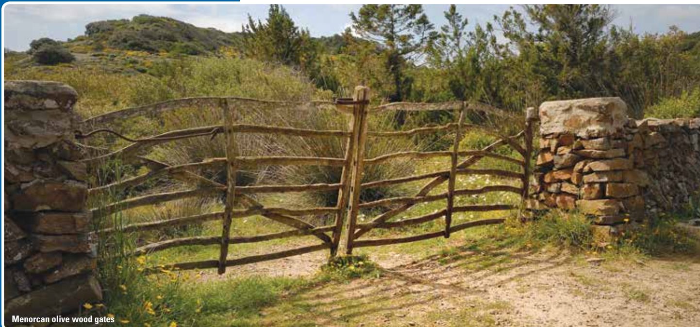
Menorcan olive wood gates