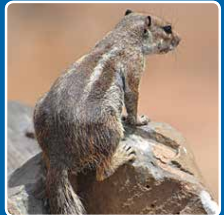
Barbary ground squirrel