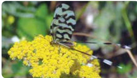
Pennant-winged ant-lion Nemoptera sinuata

The bewildering variety – 72 species on a previous visit – includes many local or unusual species: Balkan zephyr blue, Balkan copper, powdered brimstone and poplar admiral. These mingle with butterflies found more widely in mainland Europe, such as spotted, Queen-of-Spain and Glanville fritillaries, Apollo, chestnut heath, Idas blue and more.