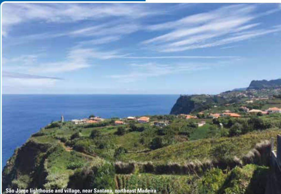
São Jorge lighthouse and village, near Santana, northeast Madeira