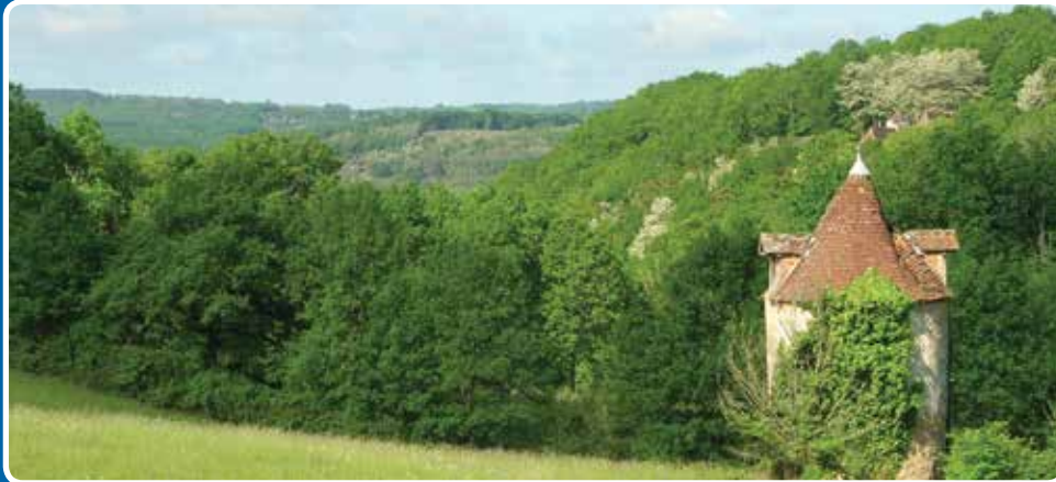
View near Castang