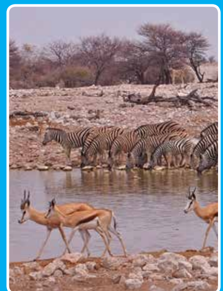
Waterhole at Etosha NP

More information visit www.honeyguide.co.uk 15