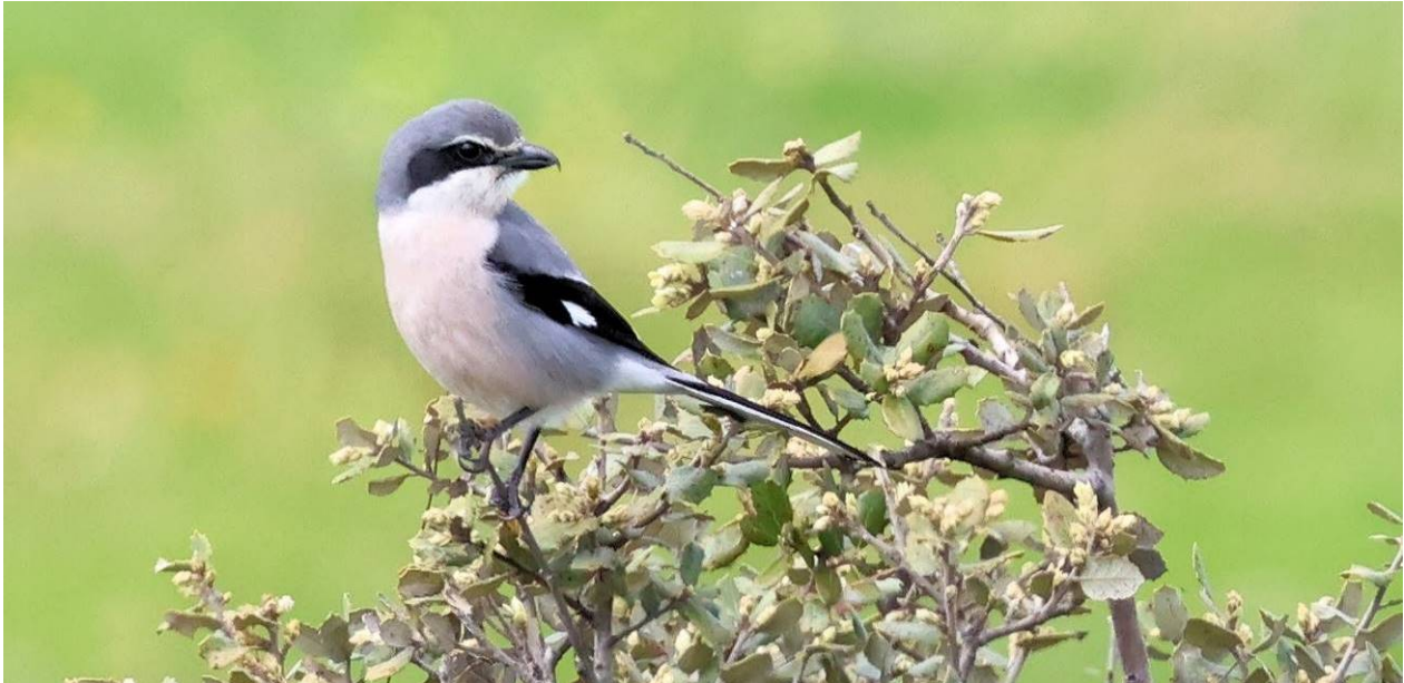
Iberian Grey Shrike.

At Campo Lugar we had our coffee, enjoying the sight of dozens of House Martins around their colony on a silo building.