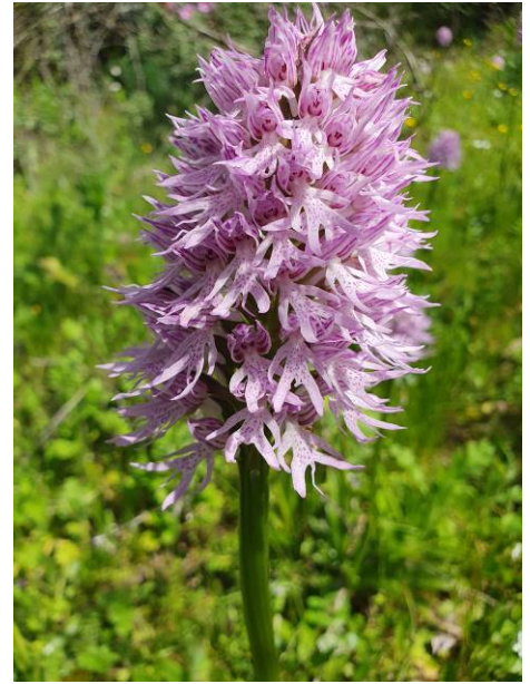
Italian or naked man orchid (JJ.)