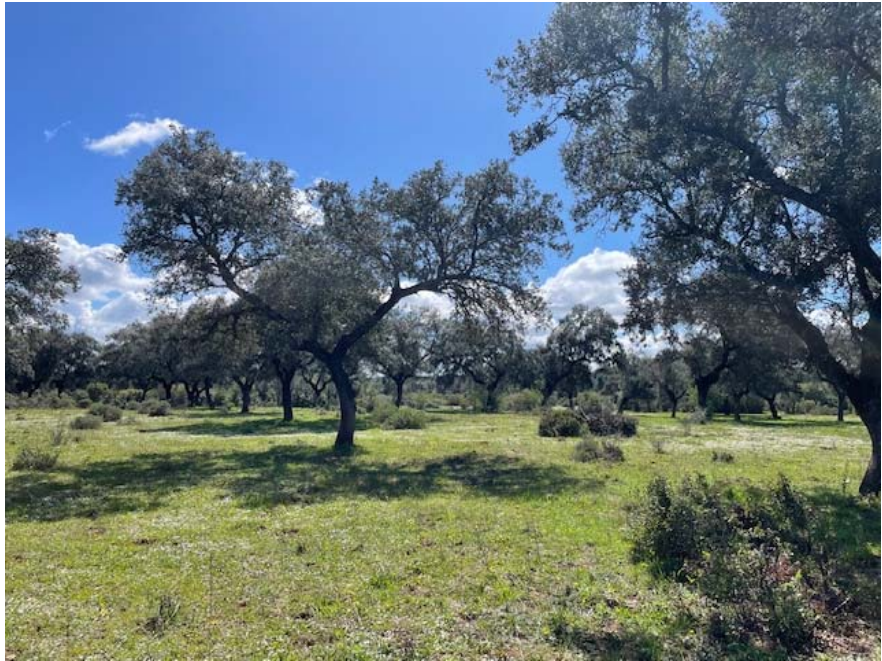
Calandra Lark (DB); the Dehesa at Sierra de Fuentes (MK).

After coffee nearby, we moved southwards a short distance to the hills beside Sierra de Fuentes. We had a superb walk through dehesa and then into Mediterranean scrub, on limestone, as the presence of Kermes Oak testified. We were not disappointed by the orchids with Sawfly, Conical, Woodcock, Naked Man, Champagne and Hairy Bee Orchid all present. The last is a very localised species in Extremadura and we found it exclusively under thick wild rosemary bushes, possibly as a way to escape the rooting of Wild Boar, which was abundant on the hillside. Butterflies included a Spanish Festoon and Green Hairstreak.