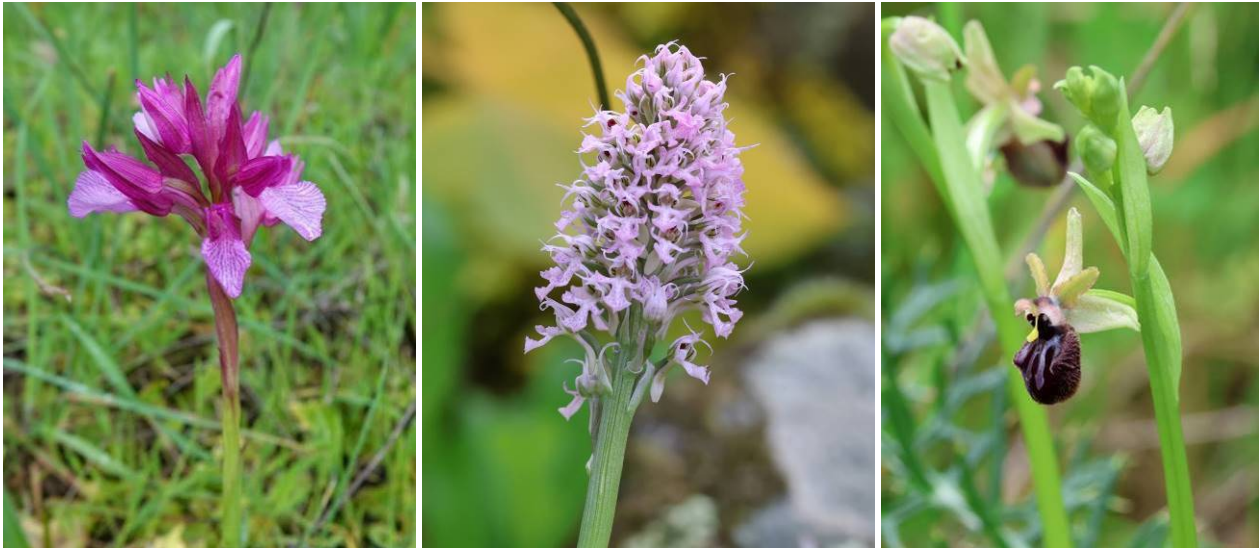
Pink Butterfly Orchid (MK); Conical Orchid and Early Spider Orchid (DB).

We then attempted to start a walk on the southern side of the rock but soon turned back because of the rain. A Quail calling close to us was the only thing of note. We moved to the Jabata Valley, a beautiful spot with dozens of Green-winged Orchids and Lusitanian Fritillaries, as well as several species of rock rose. Sadly, we had little more than a quarter of an hour to take them all in before the rain started again.