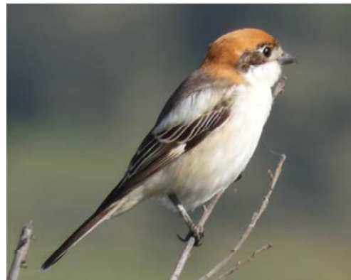
Woodchat shrike (PJ), which featured in holiday highlights.