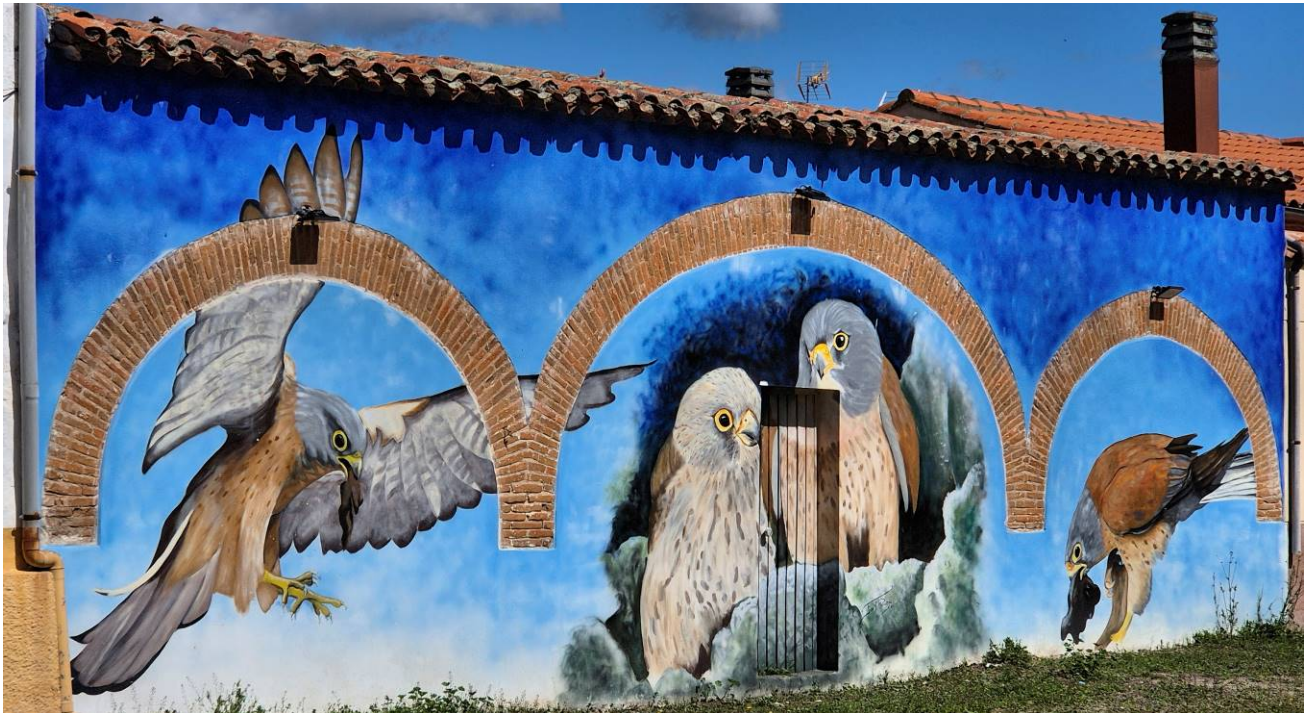
Lesser Kestrel mural at Saucedilla (DB).

In Saucedilla itself, we stopped to admire the beautiful mural of herons and egrets, the old church along with its colony of Lesser Kestrels.