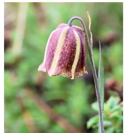
Iberian fritillary (DB).