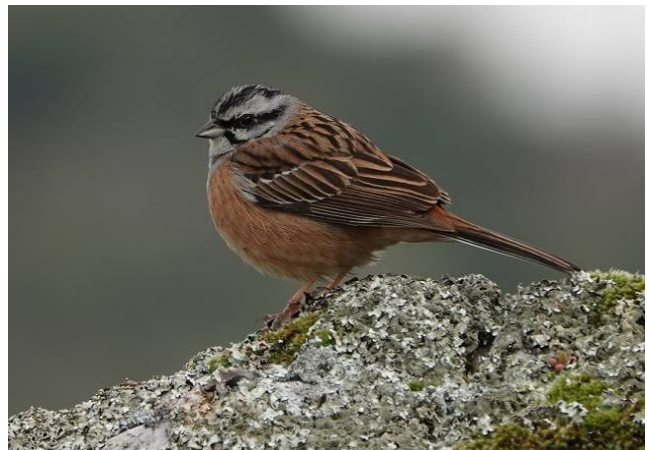
Sardinian Warbler (BD); Rock Bunting (MK).

Small birds also gave us great views, such as a very obliging Rock Bunting and a pair of Blue Rock Thrushes. Three Sardinian Warblers were delightful, while a male Subalpine Warbler generally kept in cover. Crag Martins and Red-rumped Swallows passed close-by. Spanish Adenocarpus was flowering by the road.