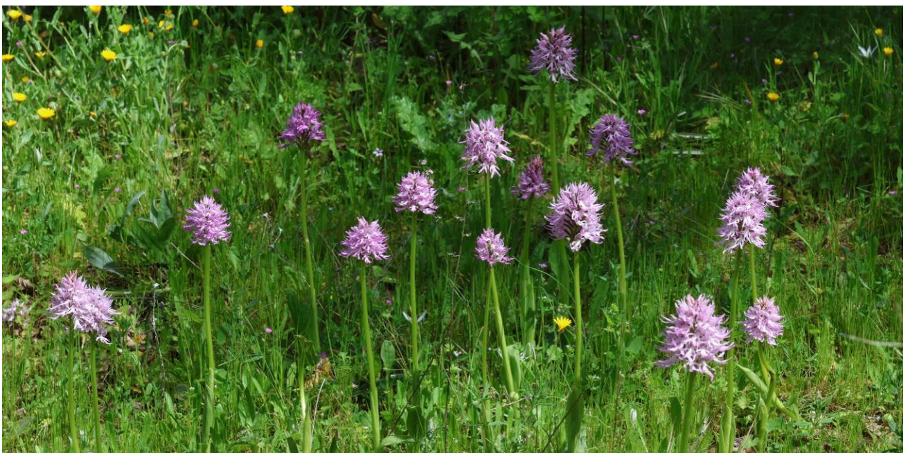
Naked Man Orchids (DB).

We then left the area to visit the hill above the town of Almaraz. On this area of limestone and old olive groves, we had the very special experience to seeing a profusion of orchids at their best, looking proud and vigorous thanks to the recent rains. Naked Man Orchid was the most abundant, but we also found Conical, Yellow Bee, Mirror, Woodcock and Champagne Orchids. This was an ideal spot for a picnic too.