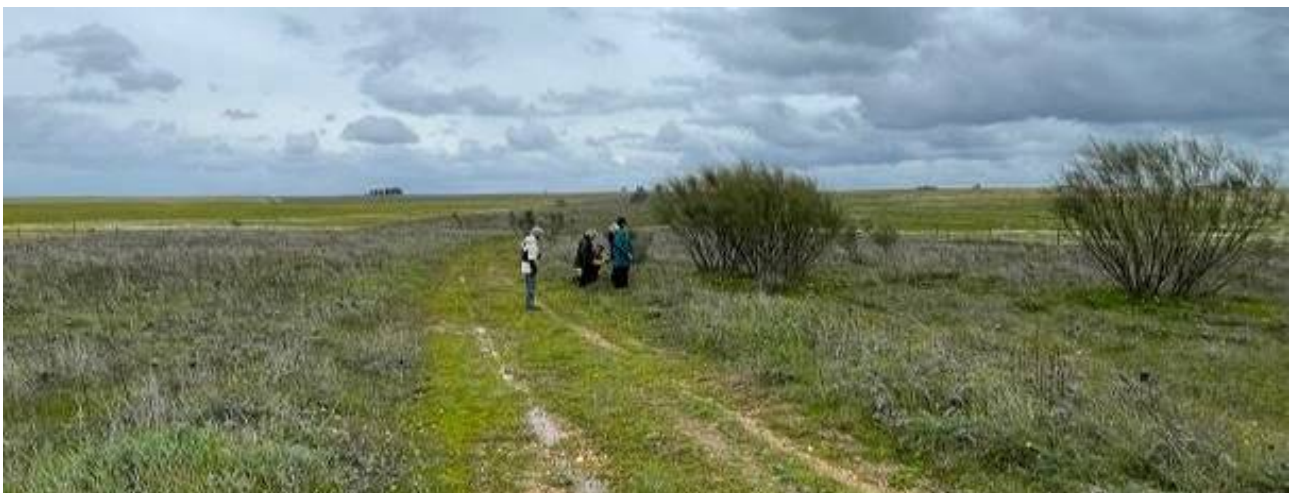
Exploring the drovers' trail (MK).

We returned to the plains to the north and stopped for a walk on a drover's trail "Cañada Real". On this strip of land, established 700 hundred years ago as common land, we found a superb colony of Sawfly Orchids. The fields beside the trail, were ablaze with mayweed flowers, looking like a dusting of snow. We moved southwards towards Trujillo, making a stop in the beautiful berrocal , a landscape dominated by granite outcrops. The flowering plants here were superb with Spotted Rockrose and the delightful Dwarf Pansy. A Merlin was seen perched on a stone in a field.