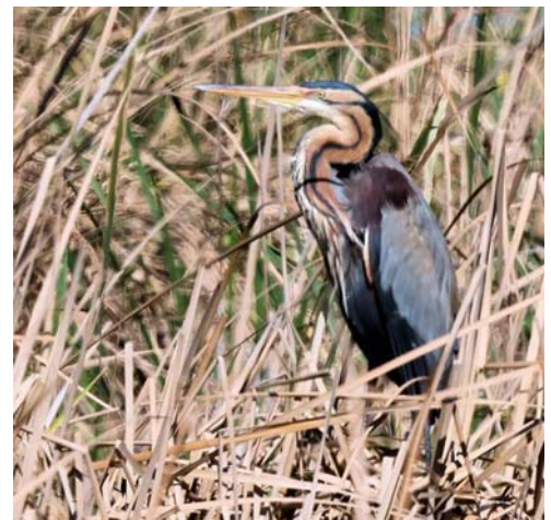
Purple Heron (DB)