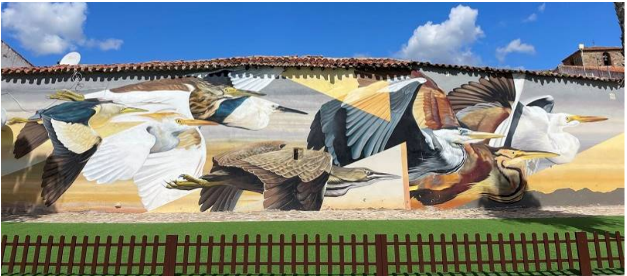
The beautiful mural at Saucedilla (MK).

Above: group photo, taken at Casa El Recuerdo; Stonechat (DB); Spanish Sparrow (DB).