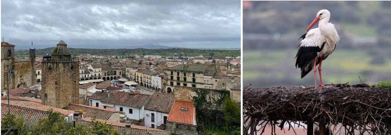
Trujillo (MK); white stork on nest in Trujillo (DB).

There had been heavy rain during the night, but it had abated by breakfast time. As we left the village, we paused at the entrance to watch a party of Hawfinches that were feeding alongside Corn Buntings and Blackbirds, turning over leaf litter in a small plantation of trees. While we were there a Lesser Spotted Woodpecker was seen briefly, as well as Iberian Magpie and Greenfinch. We stopped at the edge of Trujillo to watch Lesser Kestrels at their breeding colony in the old silo building. A few Pallid Swifts were also seen high against the darkening skies. We moved to the old part of town and walked into the Main Square and continued to explore the medieval part of the town, ascending to the Arab fortress and then back to the square. A welcome coffee in a small bar on the square was followed by some holiday shopping.