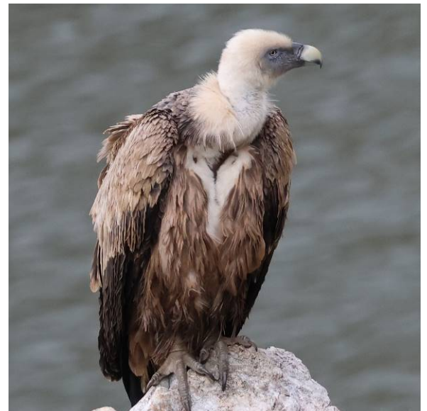
Griffon Vulture (DB)