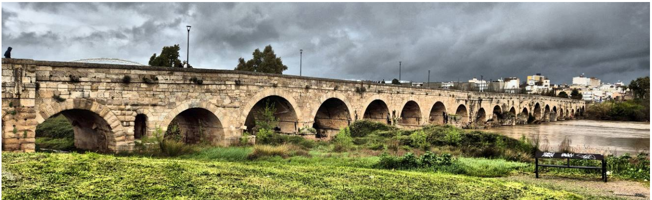
The Roman bridge at Mérida (DB).

More Spoonbills were seen downstream, as well as two flocks of Cormorants and a pair of Little Ringed Plovers. With no obvious break in the weather on the horizon, we returned to base, arriving at 16.00.