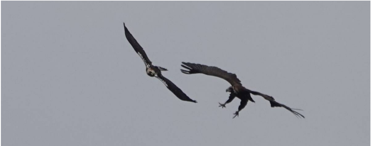
Dogfight between a Spanish Imperial Eagle and a Black Vulture (MK).

There had been some rain overnight, but by the time we set off it was dry and remained so all day. There were periods of fresh south-westerly winds, but also some sunny spells which broke up the otherwise solidly overcast sky. We spent the first part of the morning on the plains west of Trujillo. The expanse of pseudosteppe habitat was bordered by dehesa , which lay to the south of us. The immediate impression was a surround of sound from singing Calandra Larks and Corn Buntings, sometimes joined by Crested and Thekla Larks. We had good views of all of these species. As we were arriving a group of Great Bustards had flown across the road, heading south. Luckily some individuals were still present in the area we had entered, and we had good, if albeit distant, views of a small group feeding in the meadow.