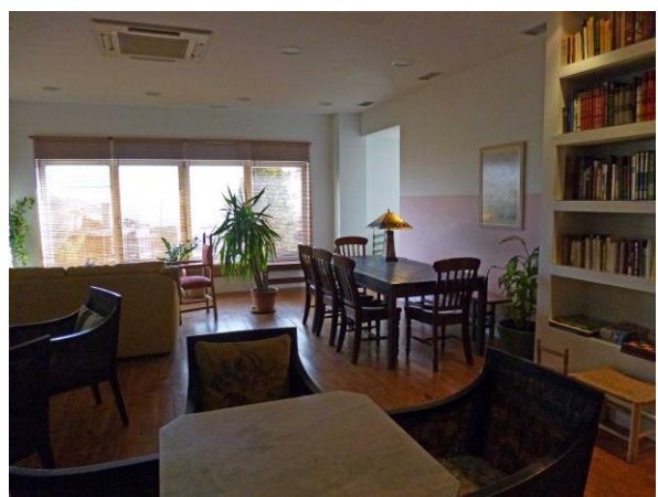
Hotel Salvatierra Rural

Day 1 Tuesday May 6th - Stansted 09:30 - MAD 12:55. Stop for light lunch on the way. Arrive Salvatierra de Tormes late afternoon. Staying at Hotel Salvatierra Rural, Salvatierra de Tormes Welcoming party at hotel from 5pm. Evening walk around the village.