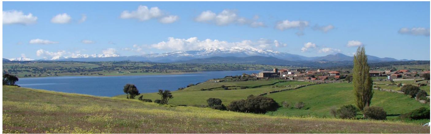
Salvatierra de Tormes, the reservoir and the mountains of the Sierra de Bejar

Day 1 Tuesday May 6th - Stansted 09:30 - MAD 12:55. Stop for light lunch on the way. Arrive Salvatierra de Tormes late afternoon. Staying at Hotel Salvatierra Rural, Salvatierra de Tormes Welcoming party at hotel from 5pm. Evening walk around the village.