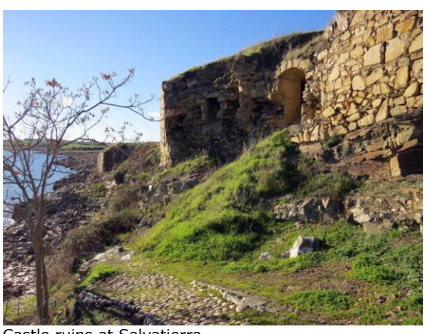
Castle ruins at Salvatierra.