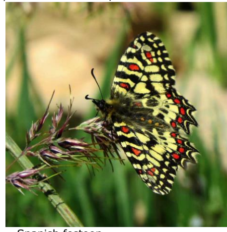
Miranda del Castañar